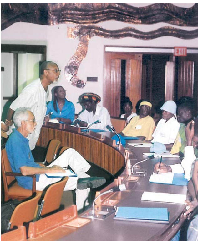
Brokering peace at meeting outside the community.

Getting the funding mix right is not the only challenge. The wider social, economic and policy landscape remains hostile to deepened peace building. High rates of youth unemployment persist. And all these programmes report being vastly oversubscribed. Schools, parents and young people themselves want to be involved in meaningful activities, but there are relatively few available in relation to the demand. More specifically, there are too few violence prevention initiatives for young men aged 14-24 who, as pointed out earlier, are disproportionately the main victims and perpetrators of crime and violence. While the programmes presented provide considerable insight into effective peace building strategies, Jamaicans must acknowledge that our high rates of violence 'did not descend on us overnight. There will be no quick fix, overnight solution' (Jamaica Gleaner, July 2008). Given these facts, a much more robust national response is required.