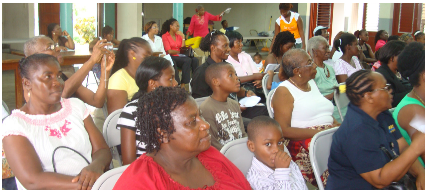
Child Resiliency Programme photo showing a session on effective parenting.

Leaders had to create a constituency to help them pursue a change agenda. Effective mentorship was a key enabler in this regard. In the CFW process, mentorship flowed in several directions. There was traditional mentorship (between people of vastly different statuses), but also peer mentorship (principals mentoring principal, teachers