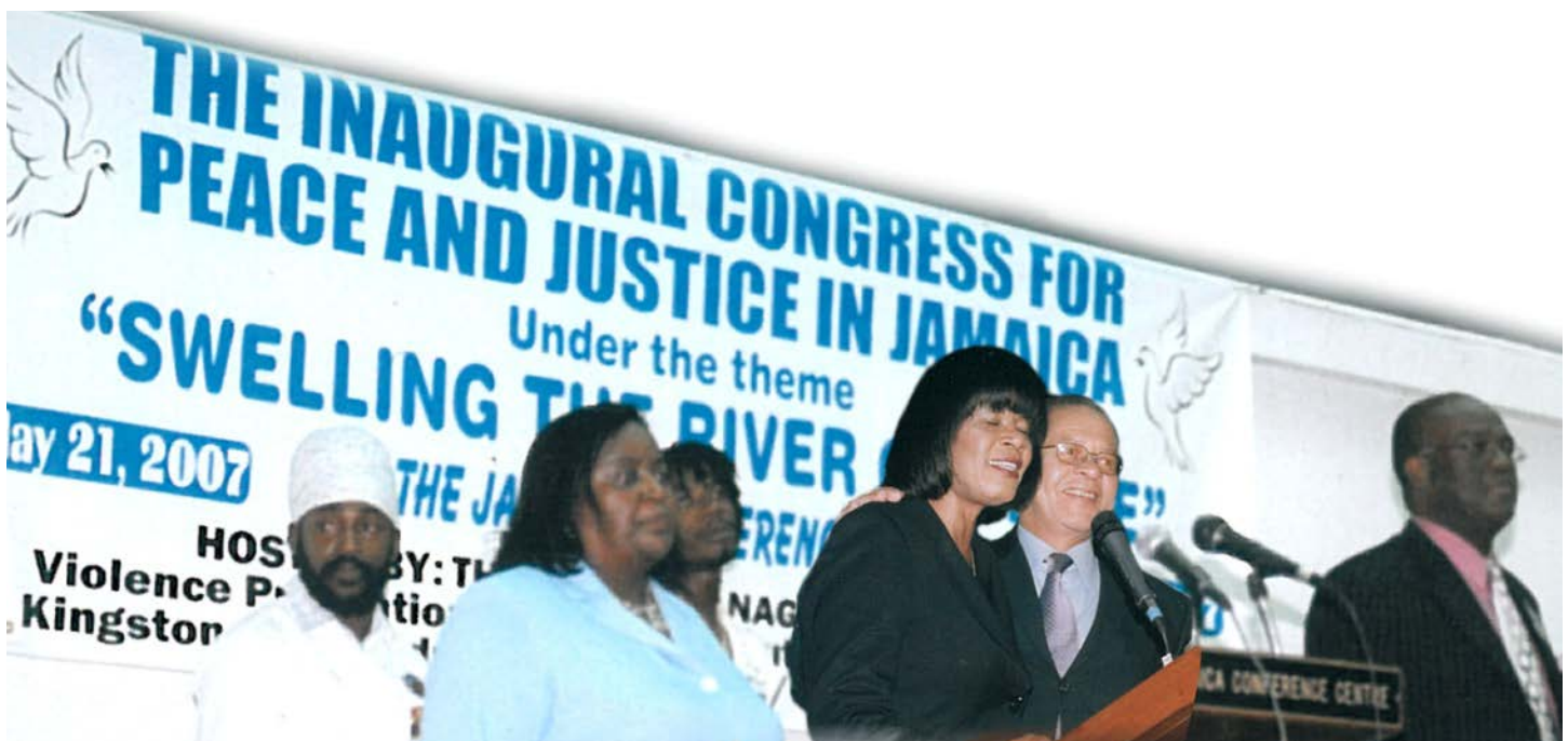
PMI involving the political directorate in peace building