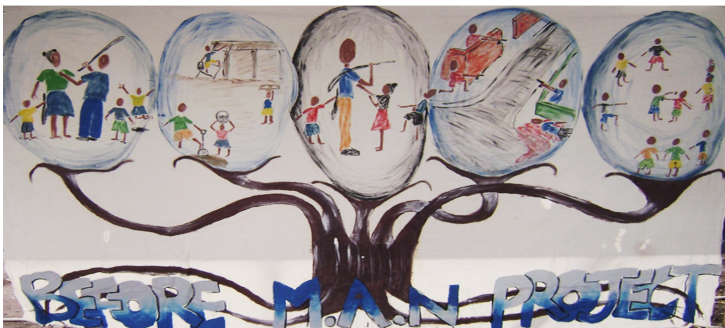
This mural shows boys depiction of community and household violence before Children First's Male Awareness Now (MAN) programme.

Violence is intimately bound up with other social mores and behaviour. CF understood that the issue of violence cannot be addressed without addressing what it means to be a man. Lack of self-esteem and positive role models are intimately connected not just with violence against women, but violence more generally as for many young men masculinity is defined in terms of violence. In response to this, it developed Male Awareness Now (MAN). The thrust of the programme is to get young people