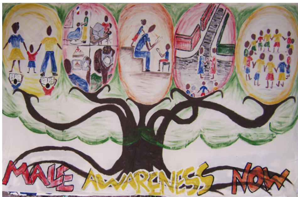
Children First mural completed after once cycle of the MAN programme showing vastly improved community and child-parent relationships