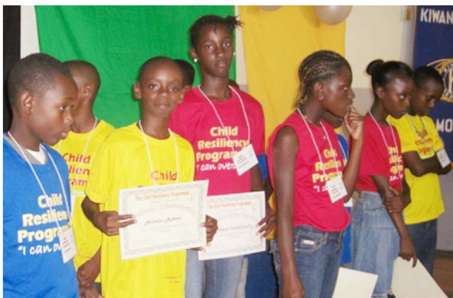
Graduates of Child Resiliency Programme showing off their certificates.

Parents are the first role models. If they do not understand and model positive social behaviours, then they cannot encourage this in their children. All three group-based processes have holistic parenting outreach and support services. CFW realized that lack of parental involvement in schools is a crucial impediment to improved behaviour and academic performance. CFW schools have thus actively sought to build relationships with parents as opposed to only communicating with them when their child has caused problems. It is also important to communicate with children about issues such as conflict management, but parents often lack the confidence and competence to do this. Training sessions where parents can draw upon each others' experience has helped to redress this problem.