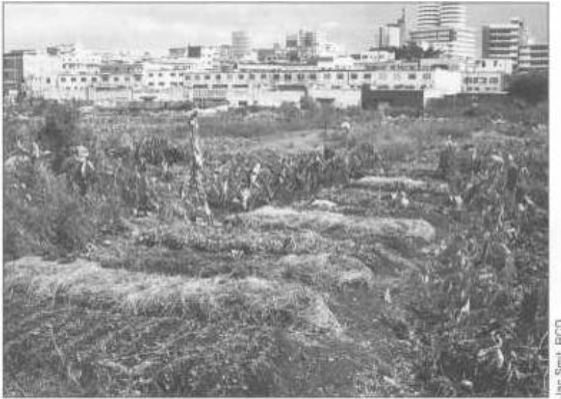
A large garden plot adjacent to a cinema in downtown Nairobi.

businesses and other urban land uses have eroded the supply of urban farm land in Nairobi and other towns.