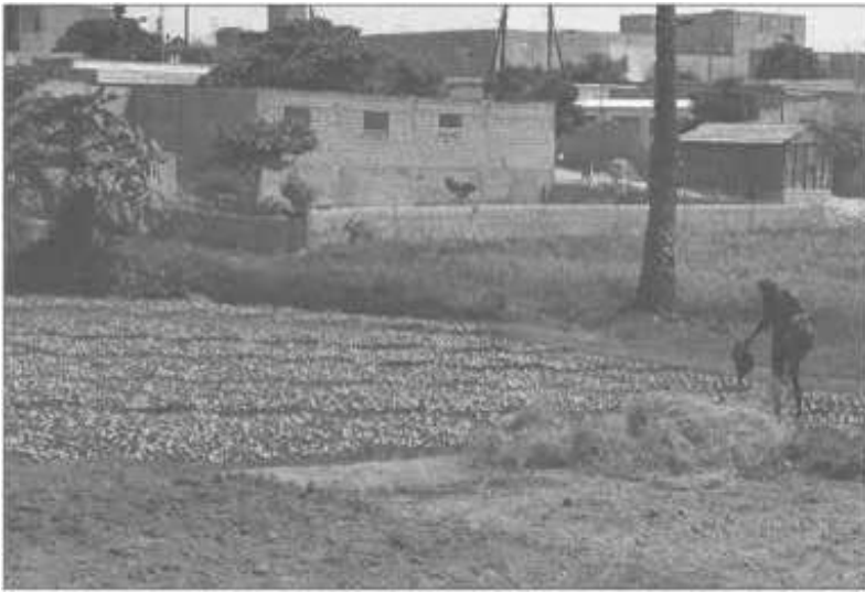
Produce paddies at the wastewater treatment plant of Pikine on the outskirts of Dakar Senegal.

It should come as no surprise that UA responds to competition for land, as do many other urban land uses. As urbanization proceeds and centrality becomes more valuable, space-demanding forms of UA migrate to more peripheral or less valued locations, much in the same way as do single-storey residences, extensive institutional uses, warehousing and industrial compounds, transportation terminals, and ground-level parking facilities. Urban agriculture that remains at central locations tends to become more labour- or capital-intensive. In 26 km 2 of central Dar es Salaam, UA initially occupied the vast increase in open public space associated with sprawl; as the urban fabric became denser, UA lost in overall area in 1981/82, but expanded in cultivated valley land, paddy plots, and vacant land under power lines (a substantial amount of open land still remained available within the urbanized area in 1981/82). As a result, the pattern of UA became more dispersed: the 1990/91 ground survey revealed that 64% of gardens were less than 101 m 2 and 25% under 51 m 2 ; more than 80% of the farmers worked other urban plots 11-20 km from their houses. Household space use intensified with 74% saying they raised livestock; most of the cattle were stall-fed (Sawio 1993, pp. 137-156). Urban agriculture does not obstruct more appropriate land development but puts to use small, inaccessible, unserviced, hazardous, and vacant areas.