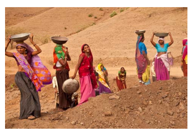
UN Women Asia and the Pacific

A large rural workfare program in India raised women's employment that in turn benefited children's education