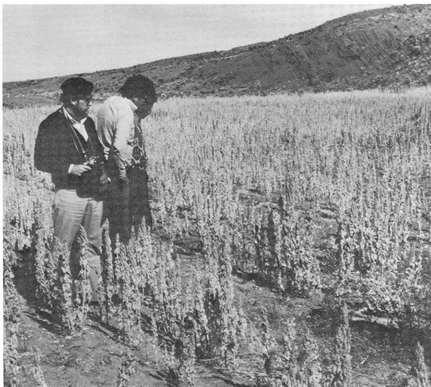
Part of the germ plasm collection at Condoriri, the experimental farm of the University of Oruro on the Bolivian altiplano. This particular crop did not do well.