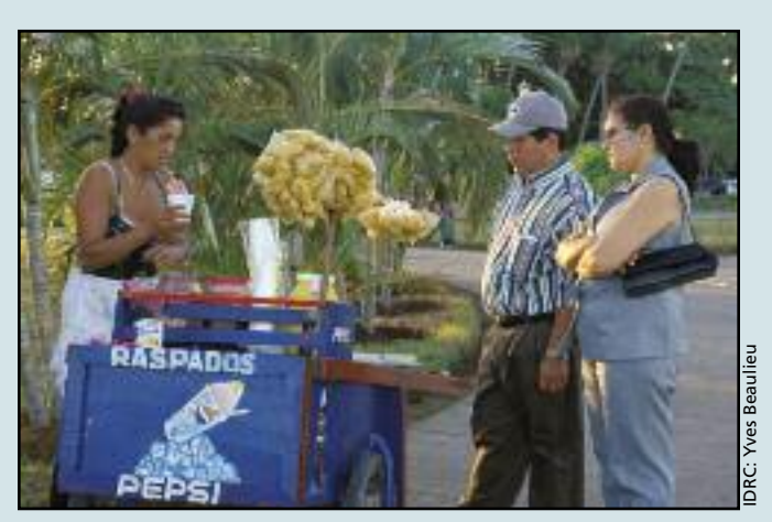
The Coca-Cola case provides a reminder that competition law can have a direct impact on consumer choice.

During the same year, three national soft drink and juice makers — La Mundial, La Cruz Blanca, and La Flor — also joined the suit. The competition agency agreed to look at the following charges: imposing resale prices and minimum purchase volumes on retailers; requiring their vending