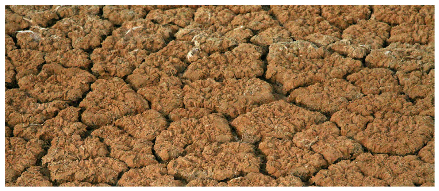
Semi-arid regions in Senegal.

The observed relationship between geography and development derives at least partly from differences relating to the fundamental characteristics of locations. For example, high transport costs, due to remoteness from markets, difficult mountainous terrains, or the fact of being landlocked, can significantly reduce the growth potential of countries by reducing trade opportunities (Gallup et al., 1999), investment and technology absorption (Henderson et al., 2001). Many of these factors are fixed (i.e. unchanging over time) and therefore will be unaffected by climate change. However, climate change is likely to result in changing risk profiles. This might have particularly important implications for economic development given the concentration of economic activity in specific locations, particularly on coasts, creating the potential for climate change to have costly impacts.