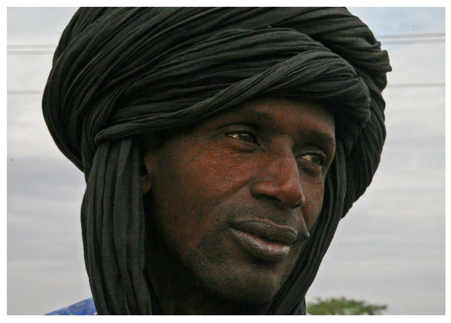
Cattle herder in Senegalese semi-arid regions.

the results of simulations carried out by these authors, if rainfall in Africa had remained at previous levels, the current gap in GDP per capita relative to other developing countries could have been between 15 per cent and 40 per cent lower.