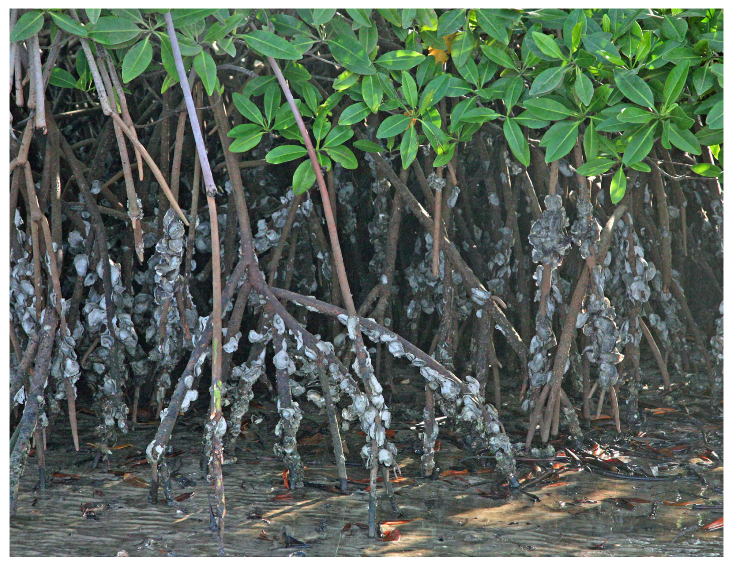
Mangroves in Senegal.

relevance of changing climatic patterns today.<sup>18</sup>