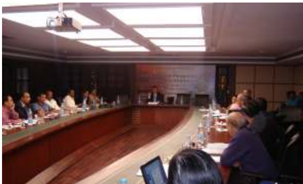
Workshop in progress