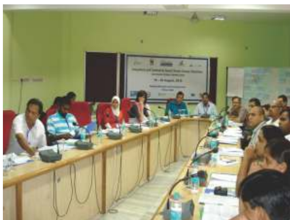
Participants at Ecosystem & community based Climate Change Adaptation Workshop

Training of Trainers on 'Ecosystem and Community Based Climate Change Adaptation' was held at the Wetlands Research and Training Centre, Chandraput on 16-20 August 2010. The course aimed to provide basic knowledge related to wetlands and ecosystem services and hands-on skills on how to deal with ecosystem and community based approaches to climate change adaptation. The training was delivered by Wetlands International in collaboration with WWF-US and Conservation International. A total of 24 participants with expertise in different ecological systems and community institutions and actively working towards climate change adaptation participated in the training. Wetland authorities - Chilika Development Authority, Loktak Development