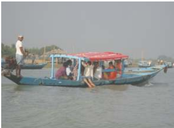
Tourist boats in the outer channel area

sources. On the other hand, unauthorized occupation of the fishing grounds for ghery operation continued unabated.