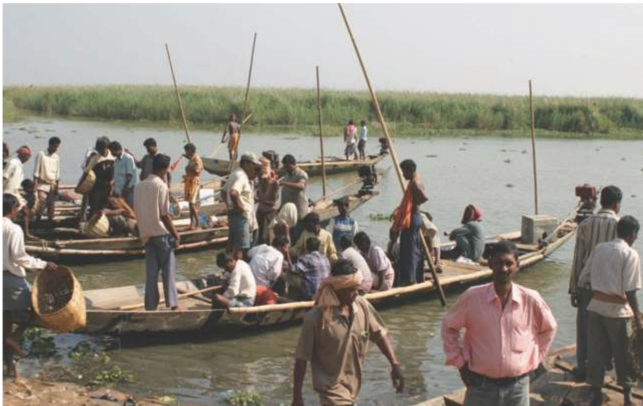
Fishers prepare for the day at Kalupadaghat