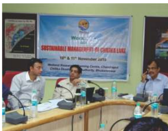
Experts at workshop on Sustainable Management of Chilika

A two-day workshop on "Sustainable Management of Chilika Lagoon" was held on 10-11 November 2010 at WRTC, Chandraput, to assess and identify the management needs and research gaps that need to be addressed to provide a long term management support system for sustainable management of Chilika. Scientists