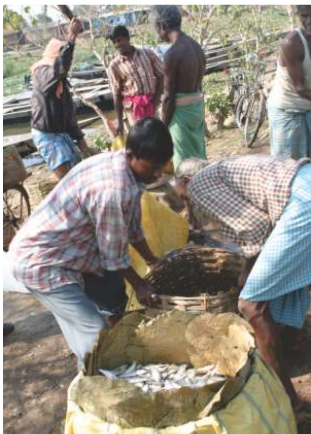
Fish haul at landing center

In 2001, the lease policy was again drastically revised. The diverse fisheries were broadly classified into prawn and non-prawn sources. Bahani, Jano, Dian and Uthapani were merged into the non-prawn category. The lease term was reduced to one year, and a single value fixed irrespective of the productivity and area (Rs.9,300 for non prawn sources, and Rs.27,900 for prawn sources). The District Collectors leased the fishery sources to the FISHFED (which replaced CFCMS as the apex agency in 1992, holding a similar mandate and objective) every year and in