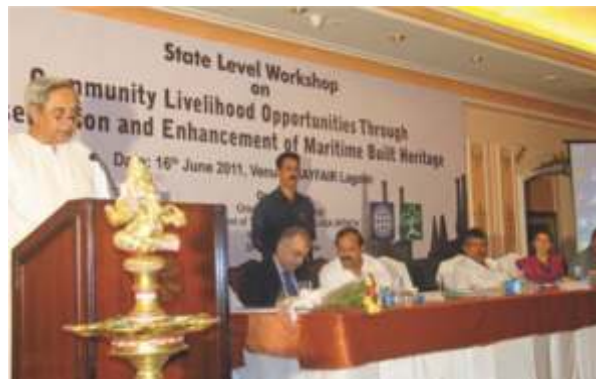
Chief Minister at Culture Workshop of ICZMP on 16 June 2011

In this context Ministry of Forest & Environment, Government of India, The World Bank and Government of Orissa have lent support to implementation of Integrated Coastal Zone Management Project (ICZMP), an initiative aimed at supporting an integrated approach to coordinate