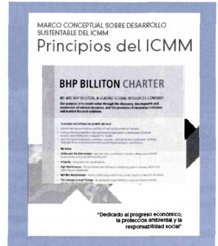
Associations of the largest companies in the sector produce guidelines in accordance with sustainability principles.

The business case for sustainable development in the mining industry is intuitively apparent but difficult to demonstrate in any quantitative sense. Certainly, sustainable development provides mining companies with a comprehensive strategy for dealing with the social, environmental and political risks that con-