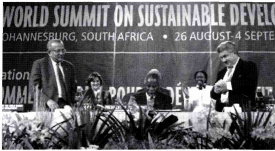
The minerals sector was integrated into the global sustainable development plan at the Johannesburg Summit in 2002. (Source: UN)

ment", acknowledged as a Type II Partnership. 3