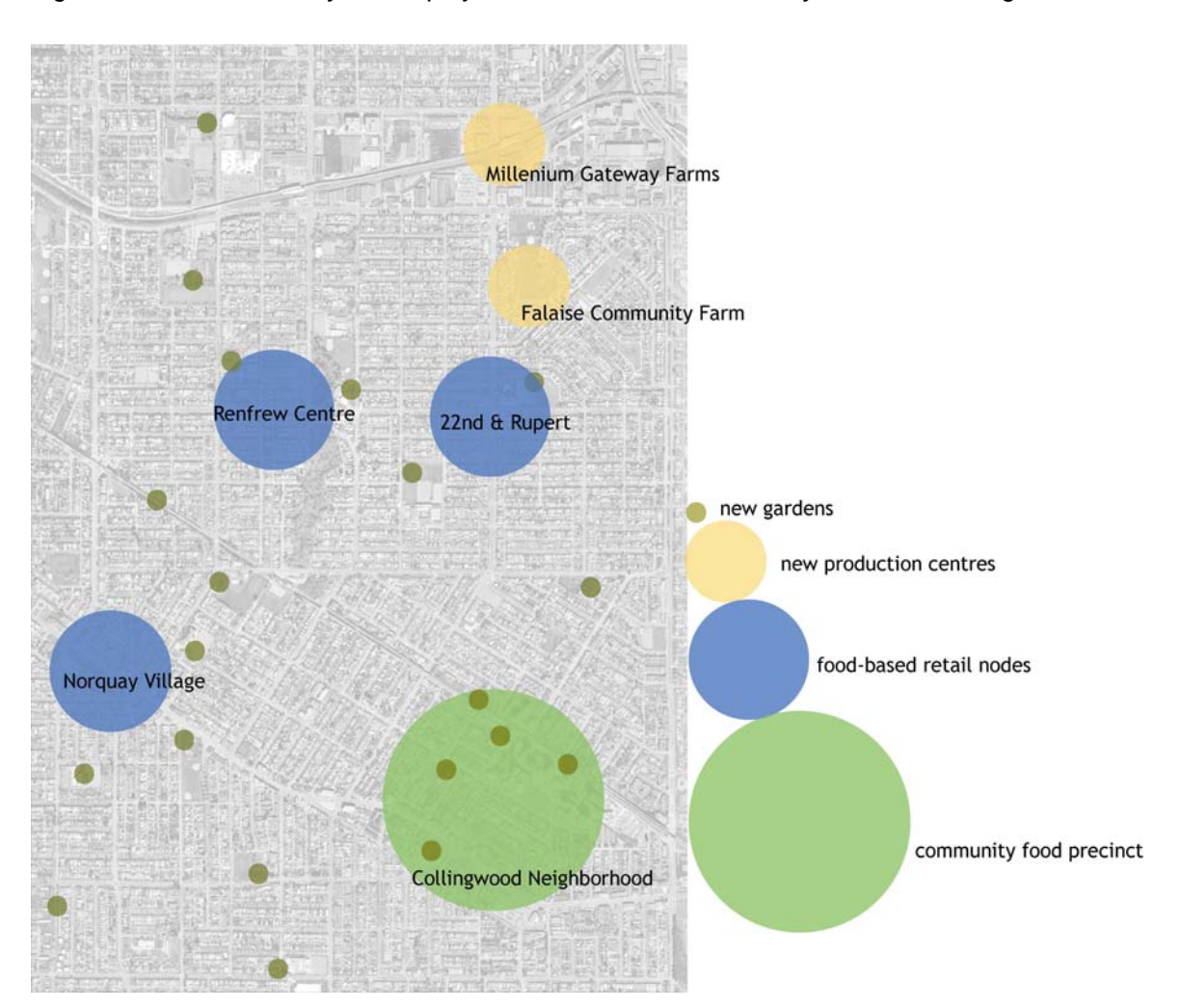
Figure 3: In this community vision, project areas are circled in olive, yellow, blue, and green.

suggests a food producing garden in almost every park and school in the area, located to serve as park entrances or active and interesting park and street edges. Rooftop farms would create gateways into the city for SkyTrain commuters, weekly public markets would animate the streets with vendors and musicians, and the towers and cisterns of composting and irrigation systems would become significant local landmarks. The net result would be neighborhoods in which productive landscapes would contribute to a far more animated and highly differentiated public realm.