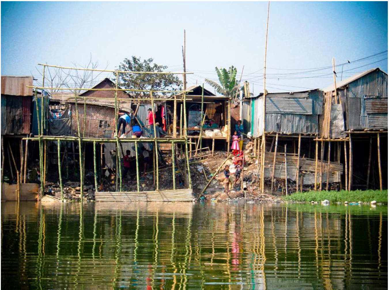
Coping with climate change in Dhaka, Bangladesh.