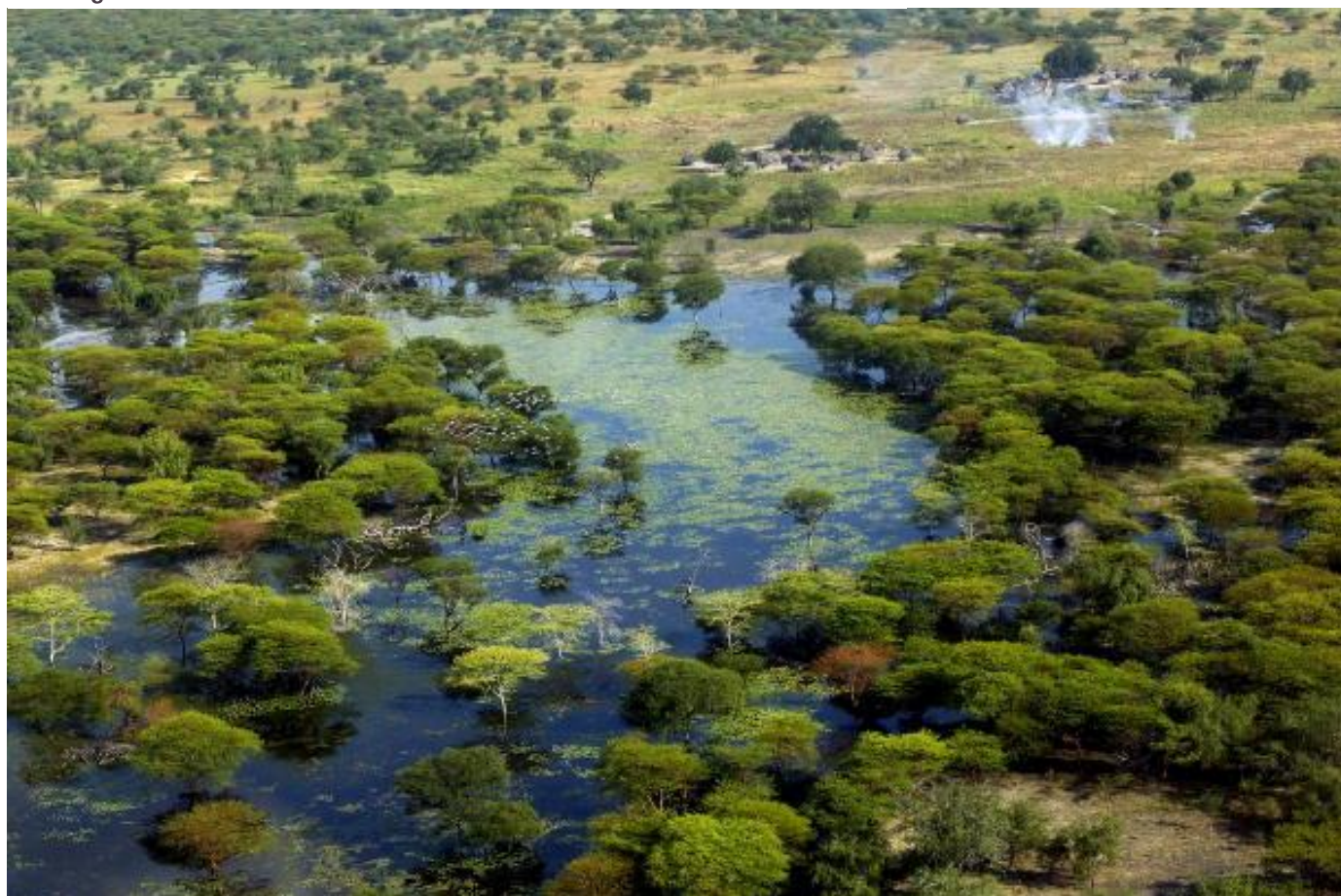
Oriny, a flood-affected village in Upper Nile State, Sudan.