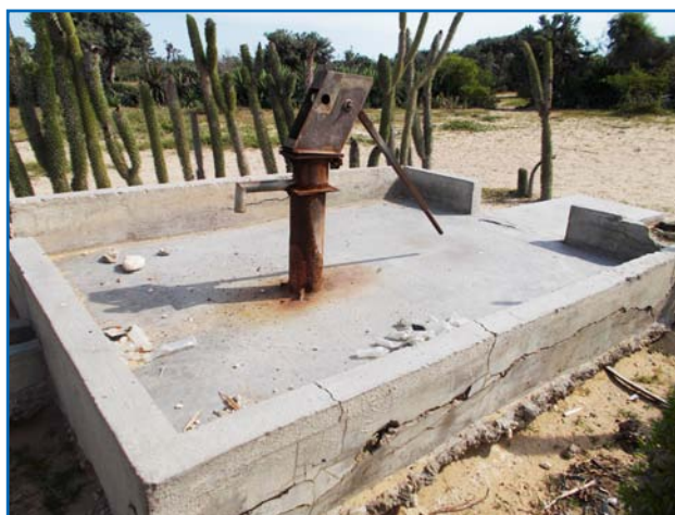
Poor management has led to wells and boreholes being abandoned