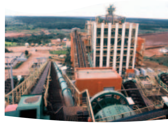
Catoca Plant, Lunda Sul

Currently, Luzamba is the only formal alluvial mining operation producing diamonds in the Cuango region. All other diamond production is from artisanal mining, although new industrial-scale projects are expected to come into operation. SDM produced $177 million of diamonds in 2003, but its present concession is expected to be exhausted in 2004.