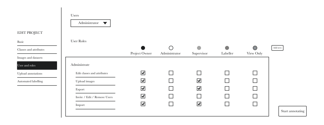
Fig. 1. Commercial data annotation tool. The project owner can grant rights to data workers.

There was a limitation on the annotation tool that they were using. They were relying on an open-source platform that doesn't have that feature that lets you add or create pre-defined attributes, which makes the work many times easier.