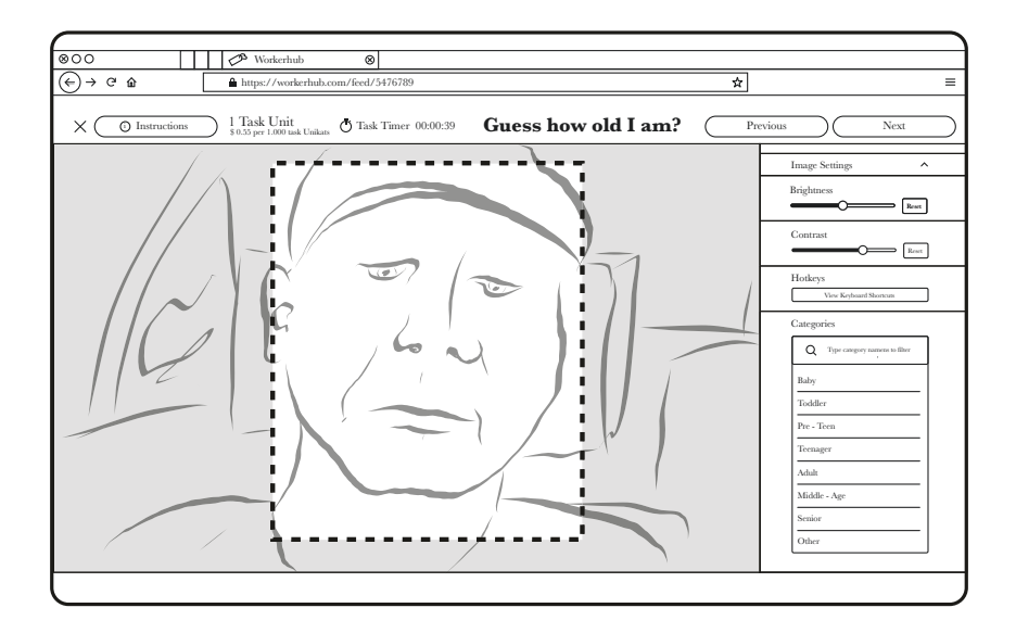
Fig. 2. Age-based classification of images on Workerhub's interface.