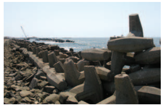
Hard adaptation measures such as this sea wall are expensive to build and need maintenance due to wave damage.

About half the labourforce works in the service sector; many serve tourists who come for the sandy beaches. About 18% make a living from fishing or farming. Some agricultural lands in the study area already have higher levels of soil salinity and alkalinity, and rising water tables have lowered productivity.