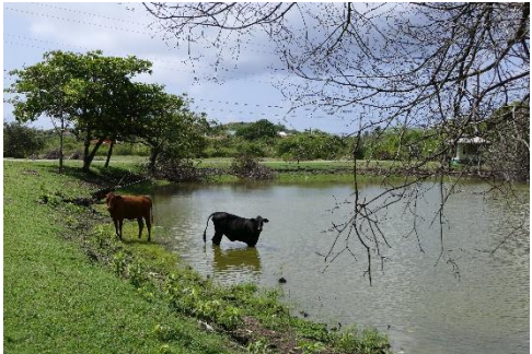
Ponds like this are used as a source of water for agriculture in Carriacou