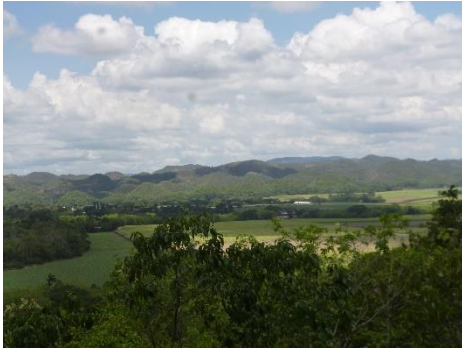
View of the Rio Cobre catchment looking north