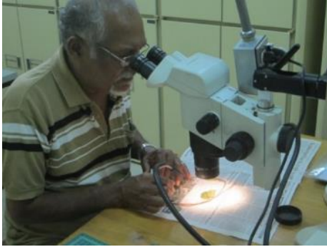
Plant identification, Trinidad Forestry Dept.