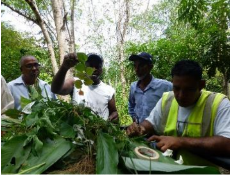
Collecting vegetation sample in the Nariva Swamp