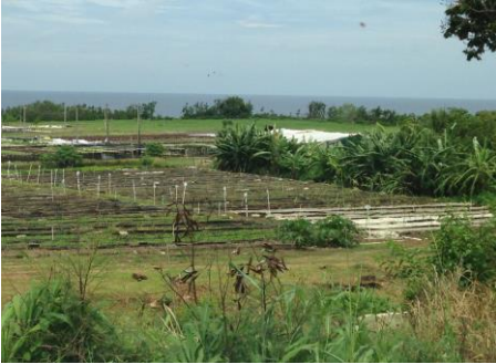
Speightstown catchment, Barbados