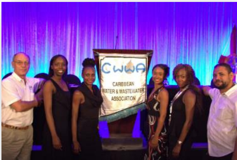
Water-aCCSIS team at the Miami, CWWA Conference