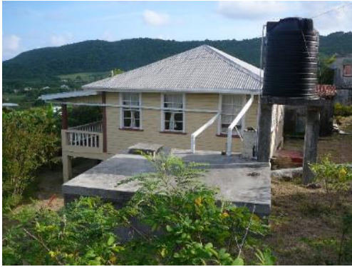
Household rainwater harvesting, Carriacou