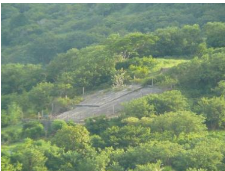
Communal Rainwater Harvesting and Cistern, Carriacou