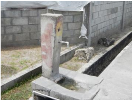
Standpipes in Hillsborough, Carriacou