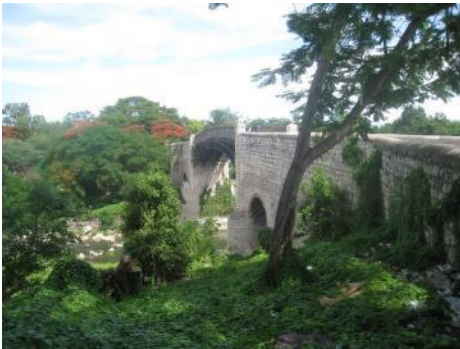
Bridge over the Rio Cobre