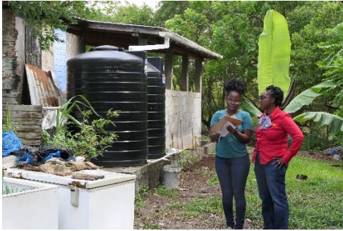
Interviewing a female farmer in Carriacou