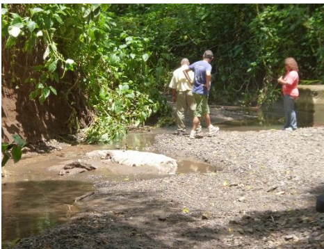
A tributary of the Rio Cobre – it disappears down a sinkhole