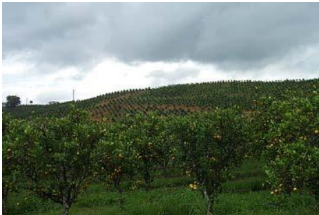
Orchards in the Rio Cobre catchment