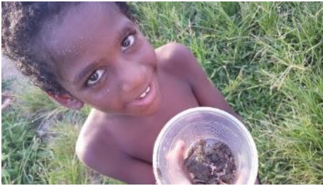
Young boy collecting crabs, Nariva