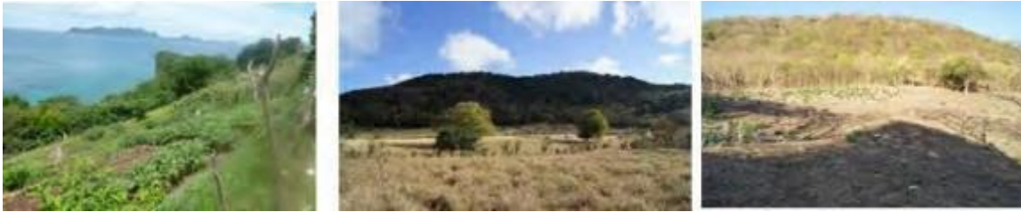
Land use, Carriacou.