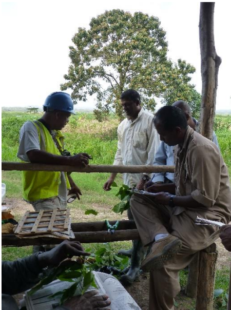
Pressing vegetation sample in the field