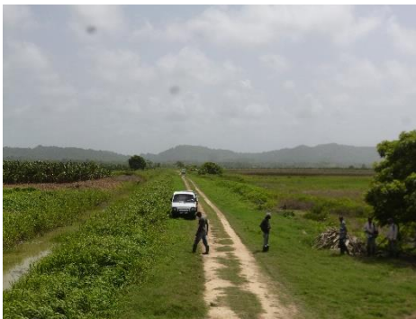
The Nariva Swamp – cultivated area, with drainage channels