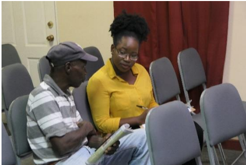
Stakeholder consultation in Carriacou