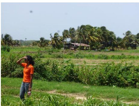
Cultivation in the Nariva Swamp, Trinidad