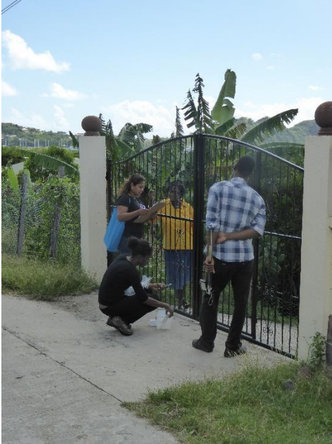
Administering questionnaire for Work Package 5