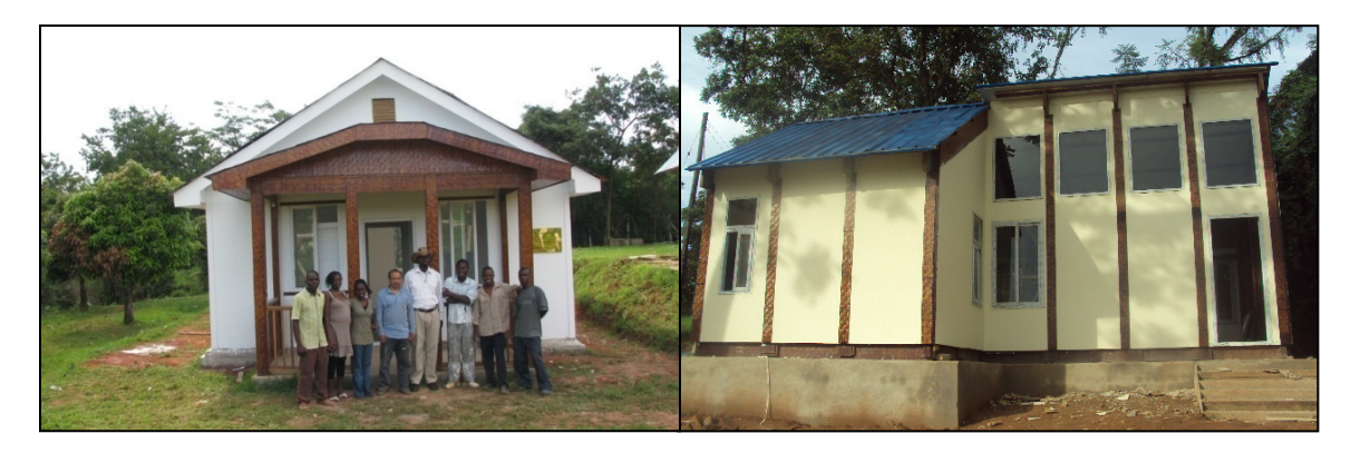
Picture 5: Engineered bamboo house in Kenya (left) and Uganda (right)

IV. <u>Engineered bamboo buildings in Kenya and Uganda</u>: the Project assembled two engineered bamboo houses; one in Kenya and one in Uganda. The sizes of the buildings in Kenya and Uganda are 56m<sup>2</sup> and 60m<sup>2</sup> respectively. A full report on the engineered bamboo buildings will be provided separately to IDRC. In Kenya, the structure will be used for a newly established University Department of Architecture and Urban Planning. In Uganda, it will be used as faculty research laboratory