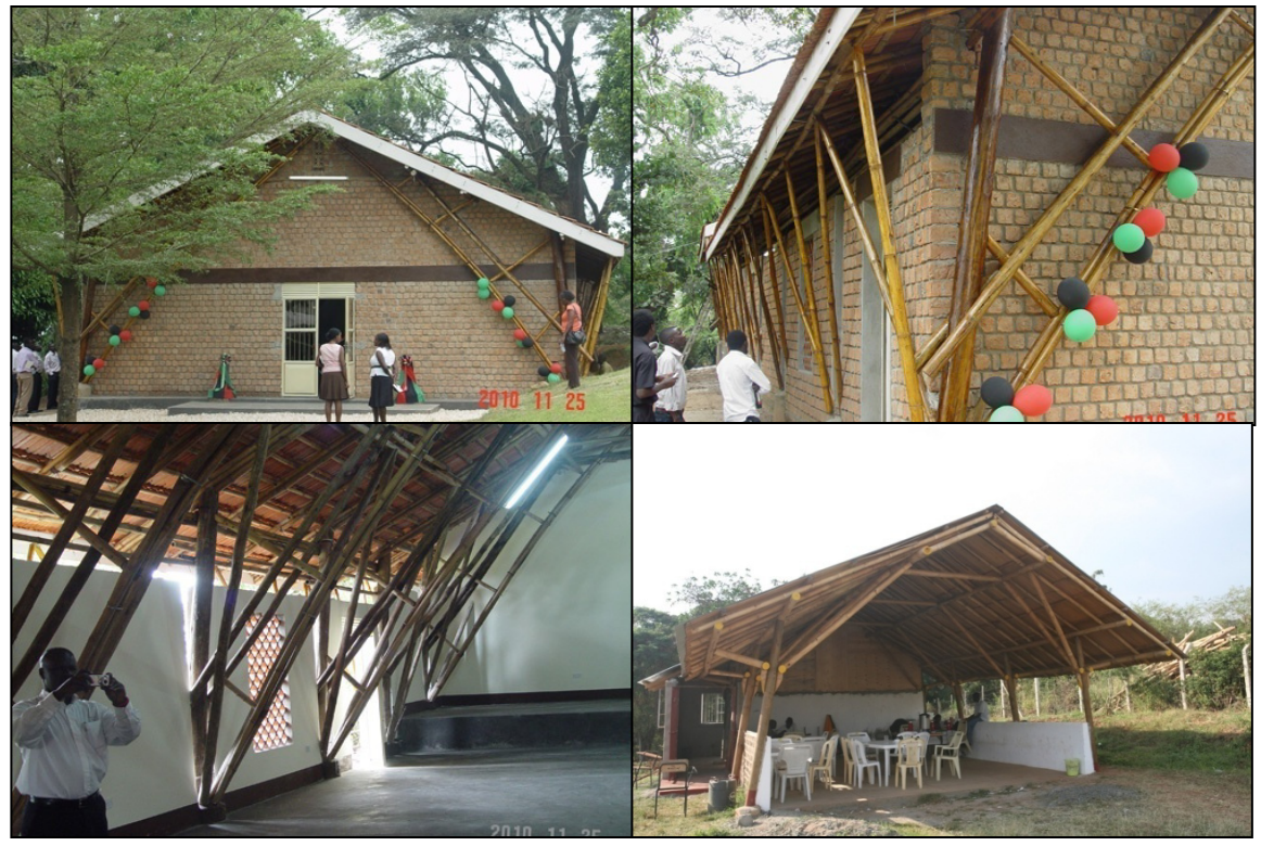
Picture 4: Finished bamboo structures in Uganda (top row and bottom left) and Kenya (bottom right)

IV. <u>Engineered bamboo buildings in Kenya and Uganda</u>: the Project assembled two engineered bamboo houses; one in Kenya and one in Uganda. The sizes of the buildings in Kenya and Uganda are 56m<sup>2</sup> and 60m<sup>2</sup> respectively. A full report on the engineered bamboo buildings will be provided separately to IDRC. In Kenya, the structure will be used for a newly established University Department of Architecture and Urban Planning. In Uganda, it will be used as faculty research laboratory