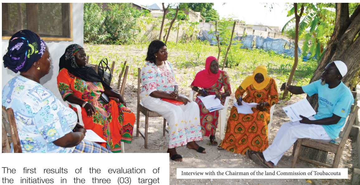
Interview with the Chairman of the land Commission of Toubacouta

Quality and equity in women's access to land in Senegal: Some lessons learned from the first results of the baseline study of the action research project «Promoting inclusive land governance through improved land rights of women in Senegal »