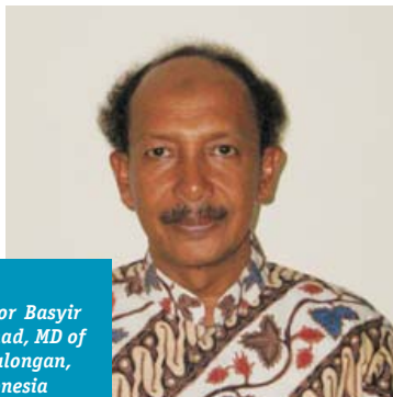
Mayor Basyir Ahmad, MD of Pekalongan, Indonesia

data processing, (g) analysis, and (h) dissemination of results.