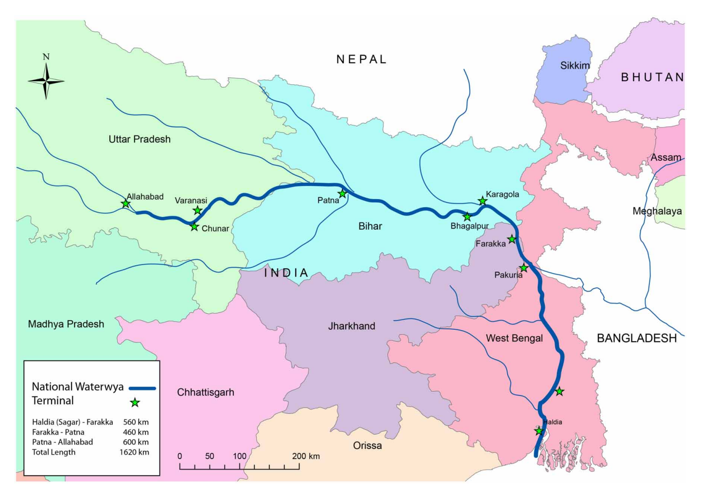
Figure 3 India's National Waterway No. 1.

the GBM river system for water transit between West Bengal and Assam. This protocol is renewed every two years. A navigational link to the Ganges and Brahmaputra could go a long way to expand trade and promote industry and regional development.