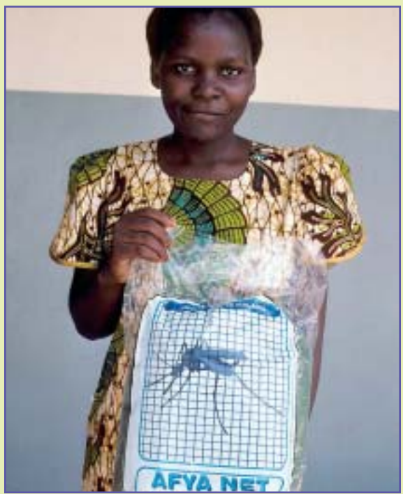
IDRC: P. Bennett

Evidence showing the large impact of malaria on Tanzanians' health has provided the impetus for significant policy changes on how to treat and prevent the disease across the country. The fight against malaria is now proceeding on many fronts, from preventative measures such as the promotion of insecticide-treated bednets to the introduction of more effective treatments, such as new drug therapies.