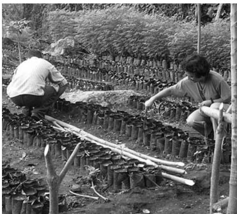
Reforestation can help control Chagas disease

first direct involvement with the "Secrétariat international francophone pour l'évaluation environnementale" (SIFÉE), a francophone network that focuses on environmental impact assessment in West Africa. Largely new to ecohealth approaches, participants at both events welcomed the concept as a novel way to deal with environmental and health issues. About 40 people from the environmental sector, graduate schools and the NGO community learned about how social and health dimensions could be included in environmental assessments from various ecohealth case studies presented by members of the Community of Practice for Ecohealth for Central and West Africa (COPEH-AOC). The institute and the colloquium also presented an opportunity for COPEH-AOC to link with new organizations in the region and to strengthen its relationship with SIFÉE. The collegial atmosphere of the meetings succeeded in enlarging and providing visibility to the existing network of ecohealth researchers and in enabling their contact with important francophone actors in the environment field.