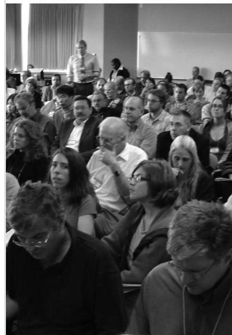
Participants at the EcoHealth One conference

More information on these opportunities will be available in early 2007 at http://www.idrc.ca/ecohealth