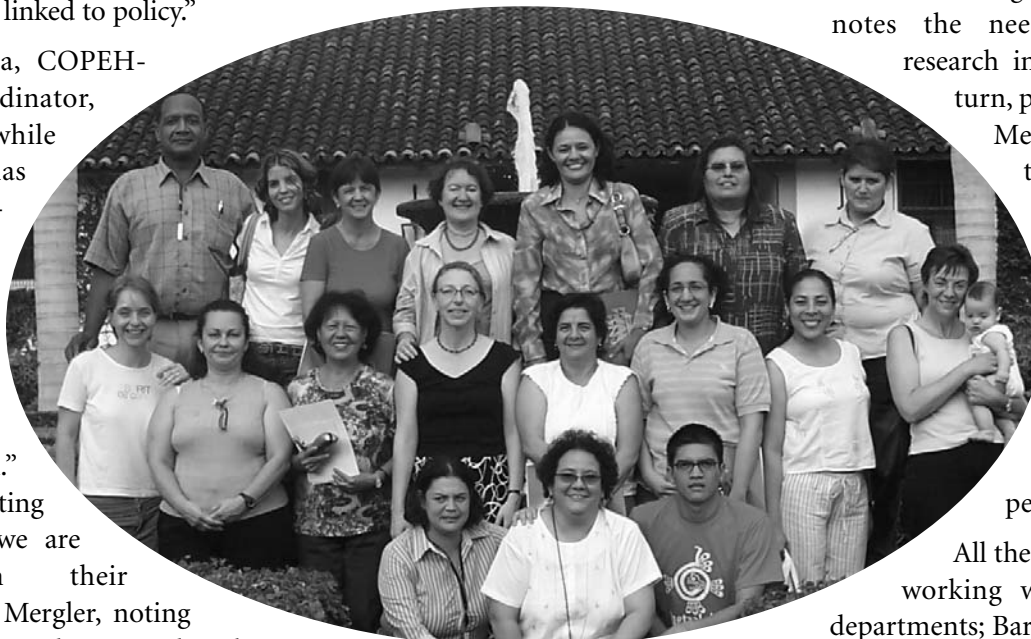
Members of COPEH-TLAC at one of six regional meetings organized since January 2006.

For more information about COPEH-TLAC visit www.insp.mx/copeh-tlac/ .