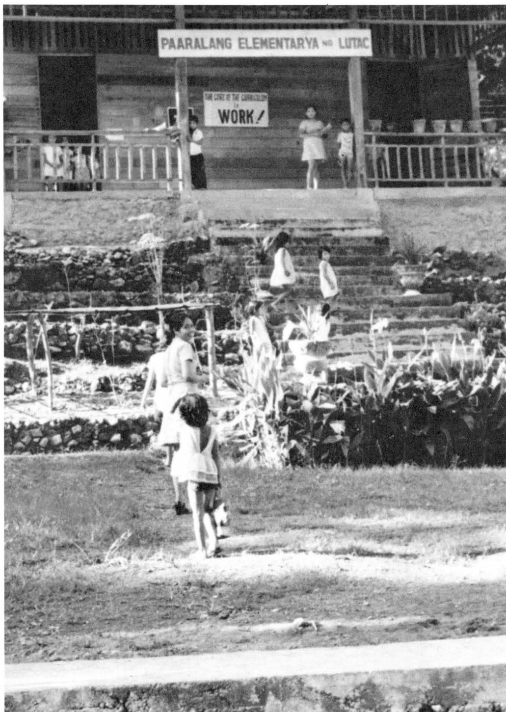
A Project Impact learning centre at Lutac Elementary School.