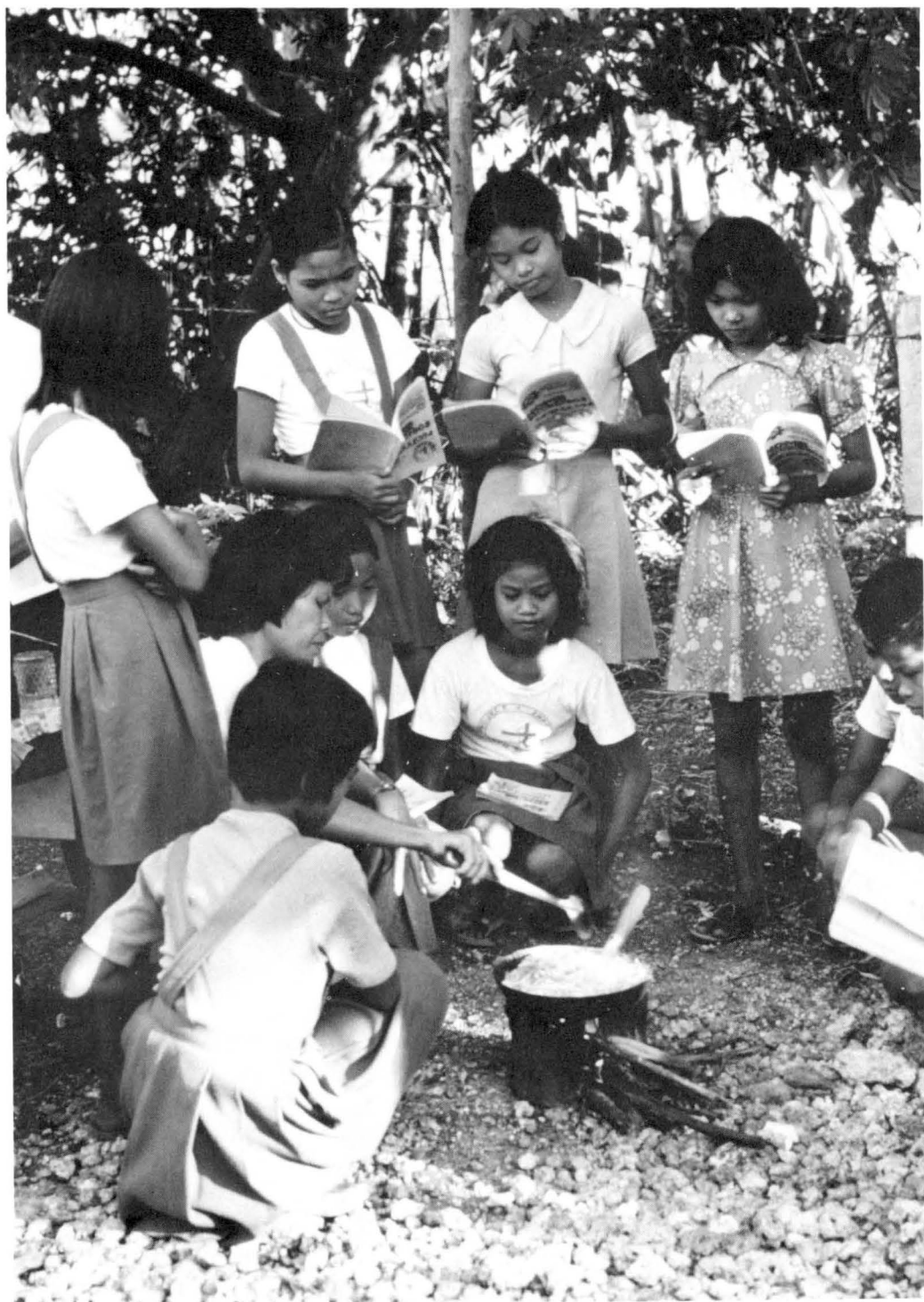
A cooking class with a community resource person.