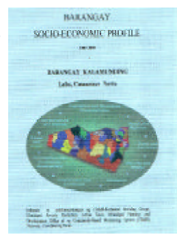
Data from CBMS were used as inputs by officials of Barangay Kalamunding in drafting their socio-economic profile.

province-wide search for the "Child-Friendliest Barangay".