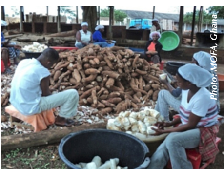
A group engages in cassava processing

Without value addition, economic value of products is low, and so also, is the incentive to invest in PH technologies. Strengthening partnerships among farmers into SMEs helps them to take