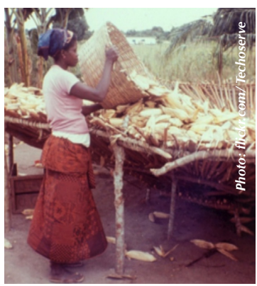
On-farm maize storage in outdoor platforms

Leading producer zones of maize are Brong-Ahafo, Eastern and Ashanti regions. Farmers sell about 60–75% of maize after harvest, thus only 25–40% is stored at farm level for subsistence or future sale at better prices. At farm level, storage facilities include traditional wood or mud silos and inhouse or outdoor platforms.