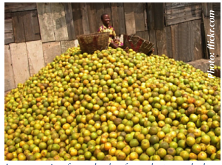
Losses arise from lack of markets and alternative means of preservation

well as quality are major constraints. Other constraints include lack of permanent market outlets, price fluctuations and poor distribution systems. A number of private firms produce in bulk for the export market. For the local market, most farmers lack