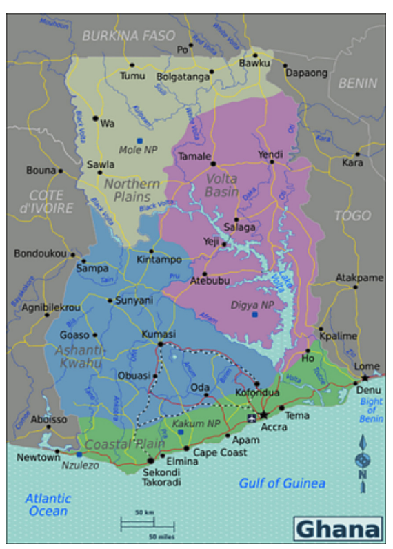
Fig. 1: Geographical location of Ghana. Ghana lies in the centre of the West African coast

Food losses contribute to high food prices by removing part of the food supply from the market. They also impact on environment as land, water, and non-renewable resources such as fertiliser and energy are used to produce, handle, process and transport food that no one consumes. Mitigating PH losses can improve food security by increasing food availability, incomes and nutrition without the need to employ extra production resources. In 2008 the government of Ghana through the Ministry of Food and Agriculture (MOFA), assessed PH losses along value chains of various food commodities, with a view to developing loss reduction policies. The initiative was guided by the realisation that fundamental changes in food systems had taken place over the years, necessitating new baseline data to be made available. Growing urbanisation, for example, has required more produce to be transported over longer distances to non-producing demand areas. Similarly, commodities have to be stored for longer periods to guarantee year-round supplies. Researchers and development agencies have to grapple with the persistent question of what direction PH innovations ought to take, so as to achieve meaningful reduction of PH losses without necessarily having to reinvent the wheel.