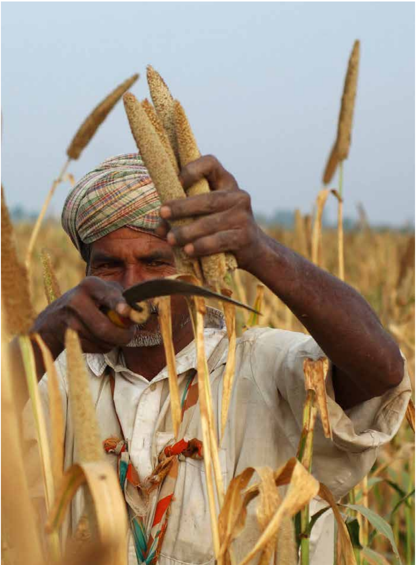
Reaping millet corn in Pakistan, © ameer_great.