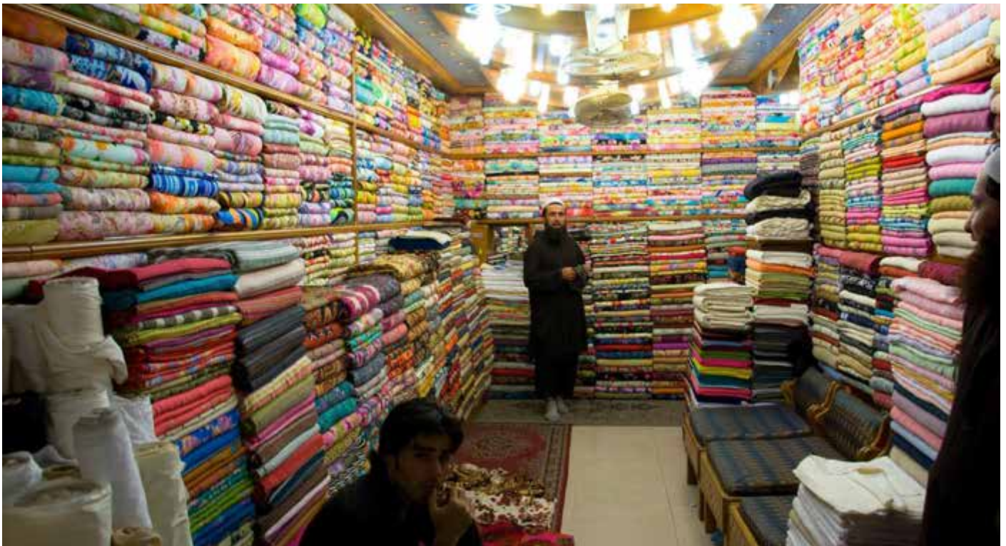
Take a look my friend, textile merchant in Pakistan, © Benny Lin , CC2.0 .

challenges to building resilience, particularly for producers in each value chain. Producers – cotton farmers in Burkina Faso and Pakistan, or pastoralists in Kenya and Senegal – typically lack access to both financial services and markets. Producers are often expected to manage climate risks, but lack the capacity to do so. Research under PRISE found that a lack of climate information services, particularly early warning systems, can be a significant barrier to small and medium enterprises (SMEs) taking climate action. Thus, the provision of climate information services, government assistance, and targeted support for adaptation would in all likelihood significantly increase adaptive capacity (Crick et al., 2018).