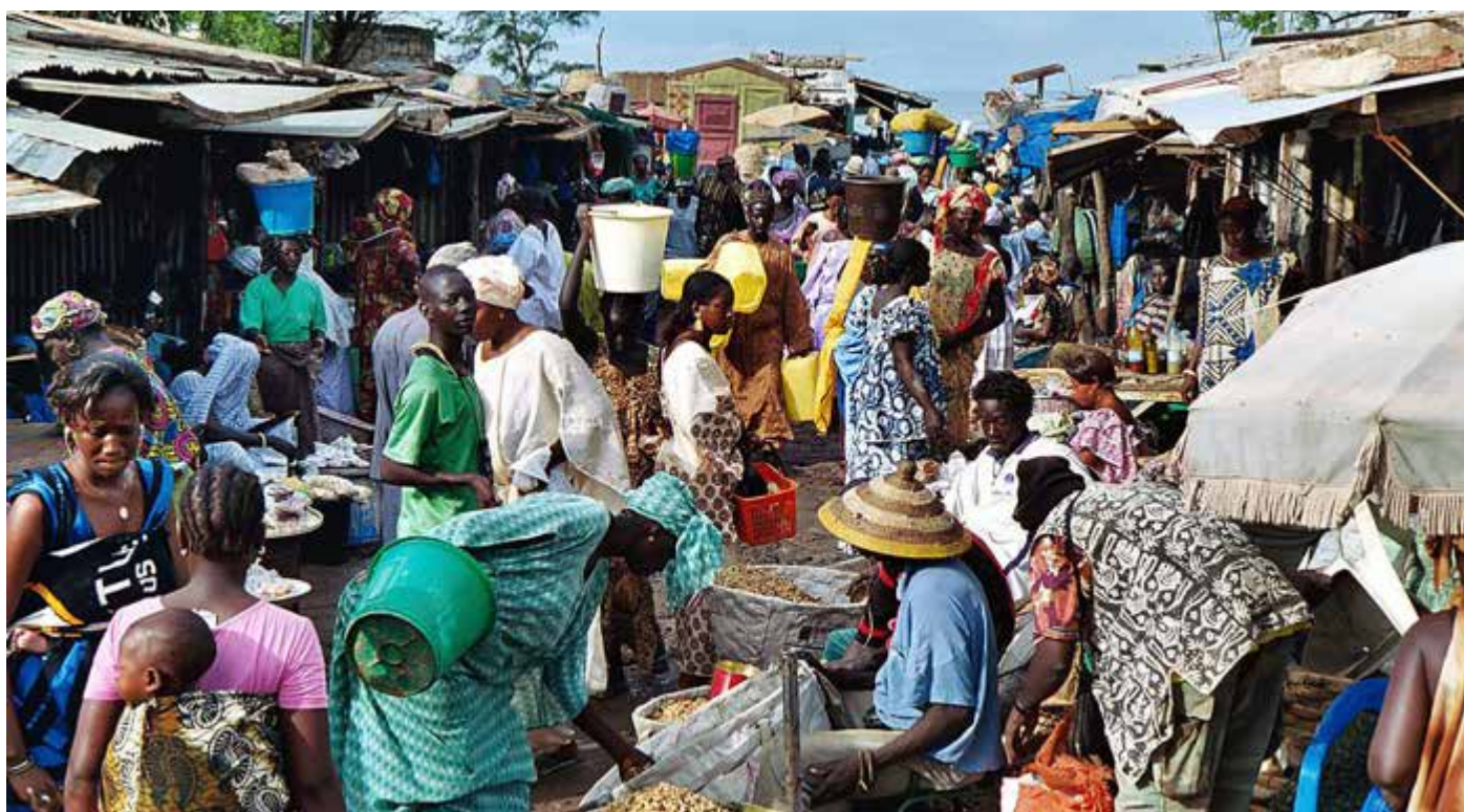
What do you want? A Senegalese market, © Jean-Paul Gaillard , CC2.0 .