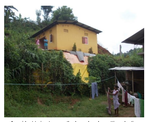
A resident trying to save the boundary by putting plastic sheet on the edge of boundary in Seujnagar

A house in Ganeshpur that got damaged in a landslide Have been cut haphazardly resulting in landslides during the rains. In the month of September 2014, there were landslides in different hills such as Kharguli and Lalmati following rains that lasted over three days. In Ganeshpur (Lalmati-Beherabari hill), a young man lost his life when a sudden landslide and mass of debris suddenly entered his room at night without giving him any time to escape (see picture). The house owner had cut the hill to build two more rooms, so that he could get extra income of INR 1,500-2,000 per month from each new room.