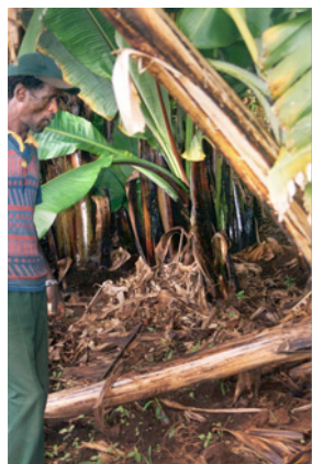
Figure 1. Farmyard manure with perennial and annual crop residues