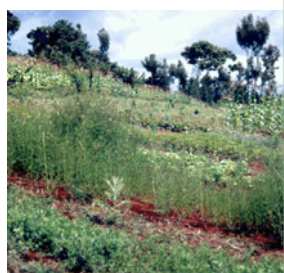
Figure 2. N-Fixing legume cover crops and biomass transfer from multipurpose trees

Farm-generated organic nutrient resources can boost agricultural production in resource-poor households. Decision guides can assist in targeting different technical options according to soil parameters, land size and market access.