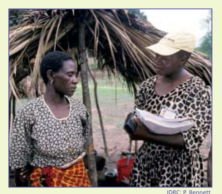
In Tanzania, demographic surveillance has been a crucial component of ongoing efforts to reform health care delivery.

on residents' health status and other circumstances, noting any changes and recording significant events (such as pregnancies, births, deaths, and changes in marital status).