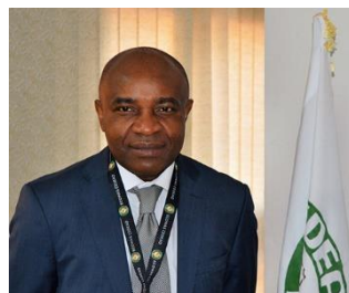
Director General of WAHO since March 2018