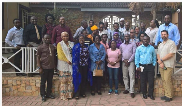
Participants of the training