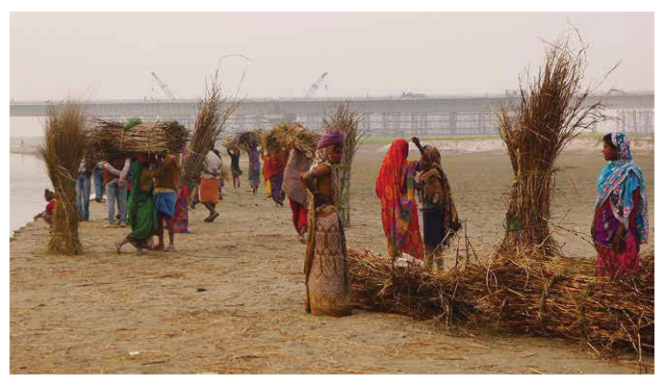
Women collect tall grass growing on the riverbed of the Ganges River near a barrage in Bettiah (India)

These outcomes advise against an overestimation of the effects of riparian interdependencies, which could create obstacles for cooperation in transboundary river-basins, for it may rationalise anxieties and fears of downstream countries regarding the effects of large upstream infrastructures (Wu et al. 2013). Further, studies also claim that a better understanding of the actual interdependence between respective countries could not only be more cost beneficial in terms of infrastructural development but also allow the riparian countries to be more open to mutual benefit-sharing, as some of the apprehensions that arise from unrealistic perceptions of dependence and ensuing tension may be moderated (Biswas 2011; Nepal et al. 2014; Rasul 2014b). While research on such analysis is on-going, we take due account of current research which recognises the existence of upstream and downstream interdependencies and need for a transboundary approach to cater to resulting water governance needs.