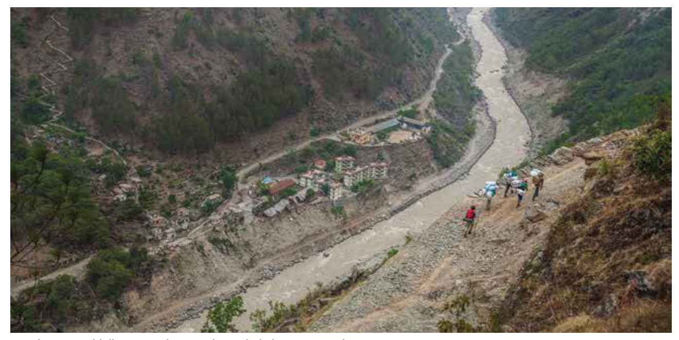
Treacherous mid-hill topography near the Mahakali River, Nepal