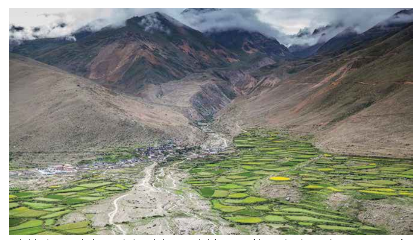
Kailash landscape in Khasha (Nepal); the Kailash Range, which forms part of the Transhimalaya in Tibet, is a water source for the Indus, Sutlej, Brahmaputra and Karnali River in the HKH