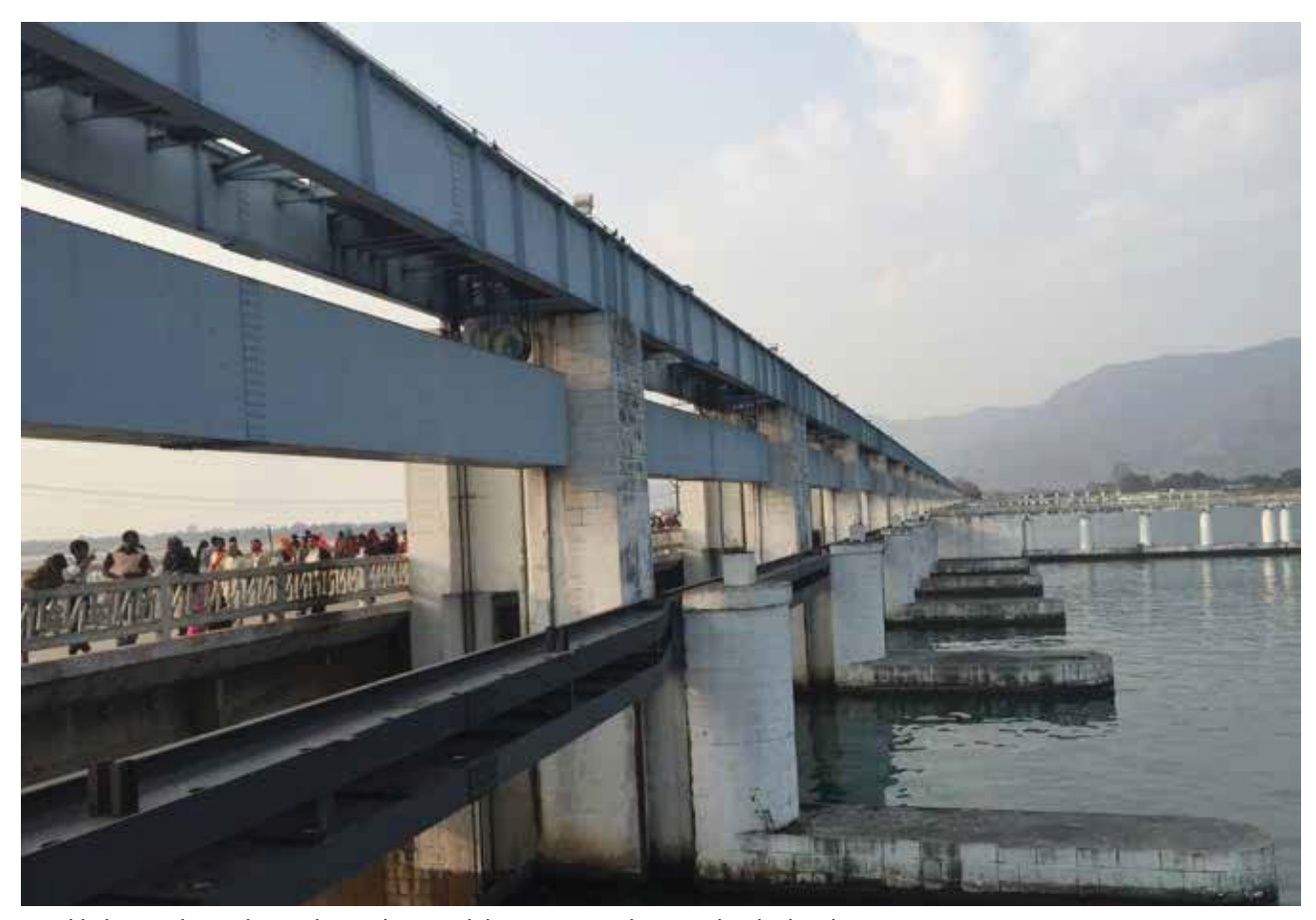
Road linking India and Nepal over the Gandak Barrage on the Nepal-India border

Transboundary water institutions have long proven to be effective forums for conflict resolution<sup>14</sup>, with spill-over effects in the political arena. For it may be argued that in many parts around the world water scarcity coupled with haphazard population growth, mal-distribution, and over-utilisation of water resources may have pushed certain areas around the world into 'arenas of conflict' (Kliot 2001, p. 252). Still, it is postulated that water wars may never be waged over disputes on transboundary water sharing alone, for countries may choose instead to move to conflict resolution through better management and utilisation of shared waters (as exemplified in the Nile Basin, see Table 1).