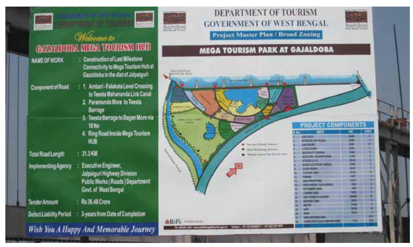
West Bengal's Department of Tourism installed a road-side hoarding board displaying a tourism park construction plan, in Gajoldoba in downstream Teesta River; Teesta is a successive international river that crosses borders

In view of this contradictory finding, it may be better, then, to consider how policy and practice across and beyond the water sector have been affected by transboundary water alliances. To this effect, we first examine some of the most prominent existing international transboundary water treaties and analyse the nature of the postulated mandates of these alliances. Then, we assess water treaties retained within the region of South Asia, examining their status, structure, and functionalities. See Tables 1 and 2, which tabulate key features of several transboundary riverbasins across the globe, including those in the HKH.