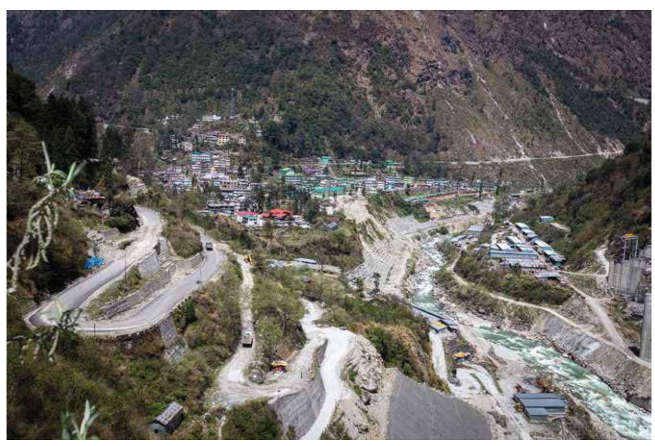
Teesta III dam wall construction at Chunthang, Sikkim (India)

Thinking along this line, learning from good and bad practices in international transboundary alliances by conducting an extended research not only to determine factors aiding or hindering collaboration but also to see what may work for each riparian country involved in the HKH may be the way forward. Current research can only help us to understand the broad notions of potential benefits, both economic and political. It may, therefore, be easy to get swayed by unhinged optimism without knowing how each country in the region could be positioned to benefit from transboundary alliances differently (Biswas 2011). For no matter how high the promise of benefit, if the issues of equitable distribution, political asymmetry, and sharing of benefits are not resolved, transboundary water governance in this region may well be limited to the boundaries of existing research.