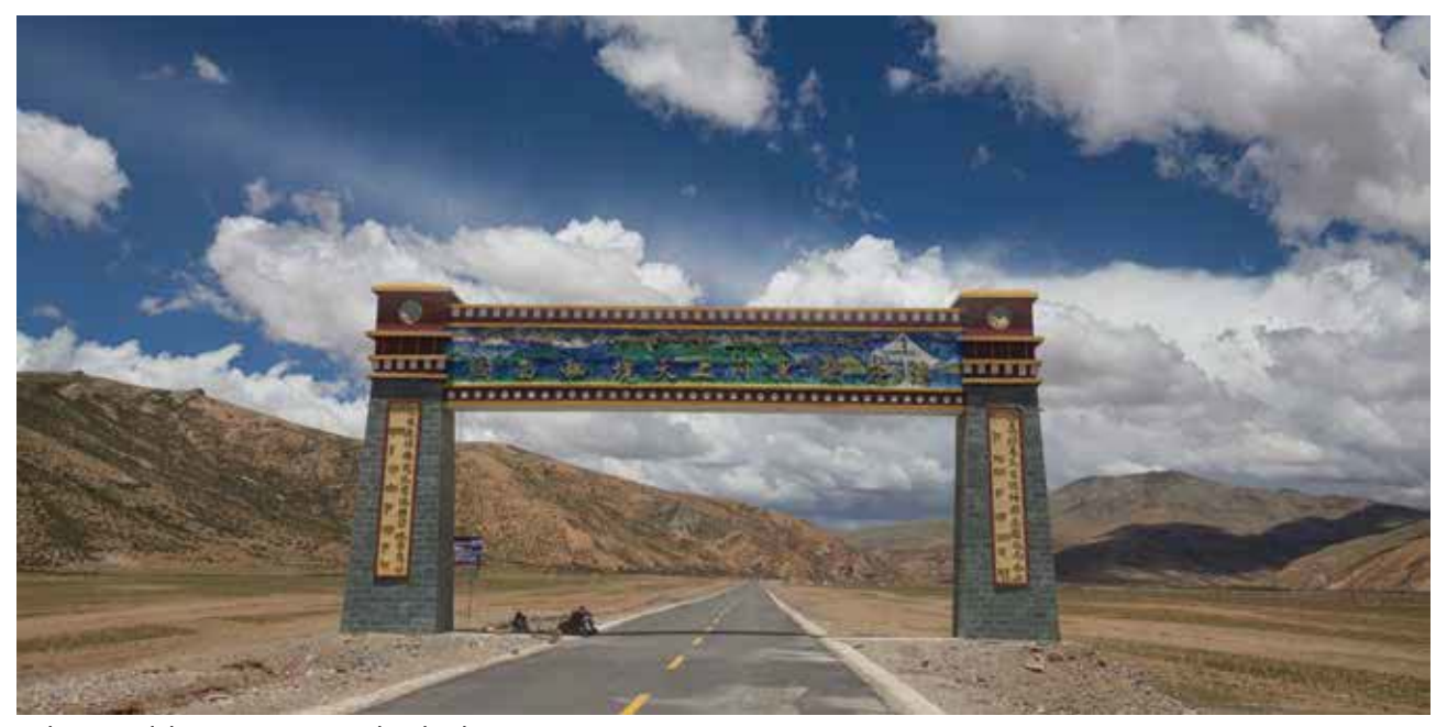
Linking road that connects Nepal with Tibet

There are two broadly framed justifications for countries to engage in transboundary management of water resources. The first is the realisation that interdependencies in the upstream and downstream areas in a riverbasin cannot be neglected, as conflicts may arise due to such indifference (Nepal et al. 2014). The second is the recognition that countries are bound to enjoy better policies and management practices in water and other sectors through collaboration (Kliot 2001; Biswas 2011; Rasul 2014b). International water laws governing transboundary waters have evolved out of experiences and past examples of water management, and it is now widely believed that basin-wide cooperation is the ideal solution to the problem of managing transboundary river-basins. In the absence of cross-border and cross-sectorial integration, it is found that riparian countries of a river-basin can get into a state of conflict over shared waters (Kliot 2001; Mirumachi and Allan 2007; Zeitoun et al. 2011; Akanda 2012).