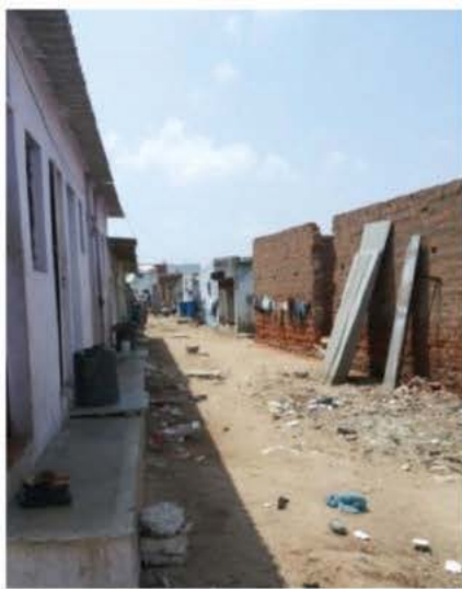
Partially constructed buildings (seen on the right) which are taken up for illicit activities

Lack of streetlights creates opportunities for thefts and burglaries in the locality. While some of the main roads have had streetlights for a few years, the internal roads are pitch dark after sunset. In some societies, local politicians have provided streetlight poles but lights have not been installed as yet. In some societies, residents have light bulbs outside their home but it is not affordable to keep these bulbs on all night.