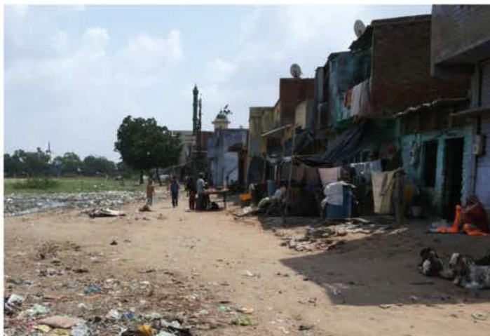
One of the housing societies built by a builder in Bombay Hotel

Several factors have come together to create these unsafe conditions. The state has been largely absent in the locality in terms of planning the built environment and providing infrastructure and services. The rise of some individuals and groups that exert control and power over the other residents of the locality through coercion, threats and direct violence, and the fear that residents experience on a regular basis for their life, family and property are a consequence of this absence of the welfare state as well as the absence of responsive policing. The prevailing social and economic conditions in the locality create a particularly fertile ground for crime and violence to flourish.