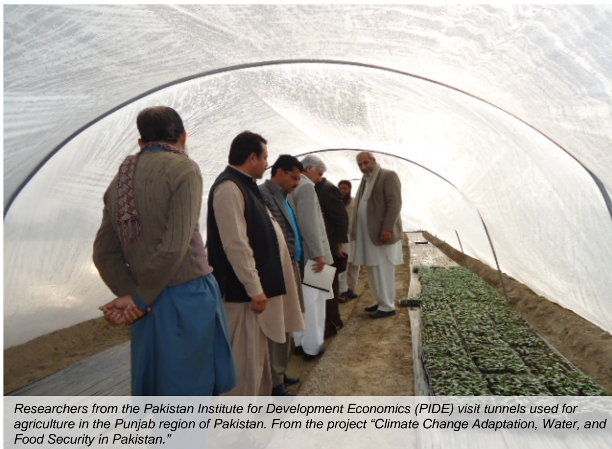
Researchers from the Pakistan Institute for Development Economics (PIDE) visit tunnels used for agriculture in the Punjab region of Pakistan. From the project "Climate Change Adaptation, Water, and Food Security in Pakistan."

Another project studying farmers' perceptions and adaptation strategies is finding that climate change impacts are influencing agriculture in Pakistan. This study, led by the Lahore University of Management Sciences (LUMS) in partnership with the World Wildlife Fund for Nature - Pakistan (WWF-Pakistan),