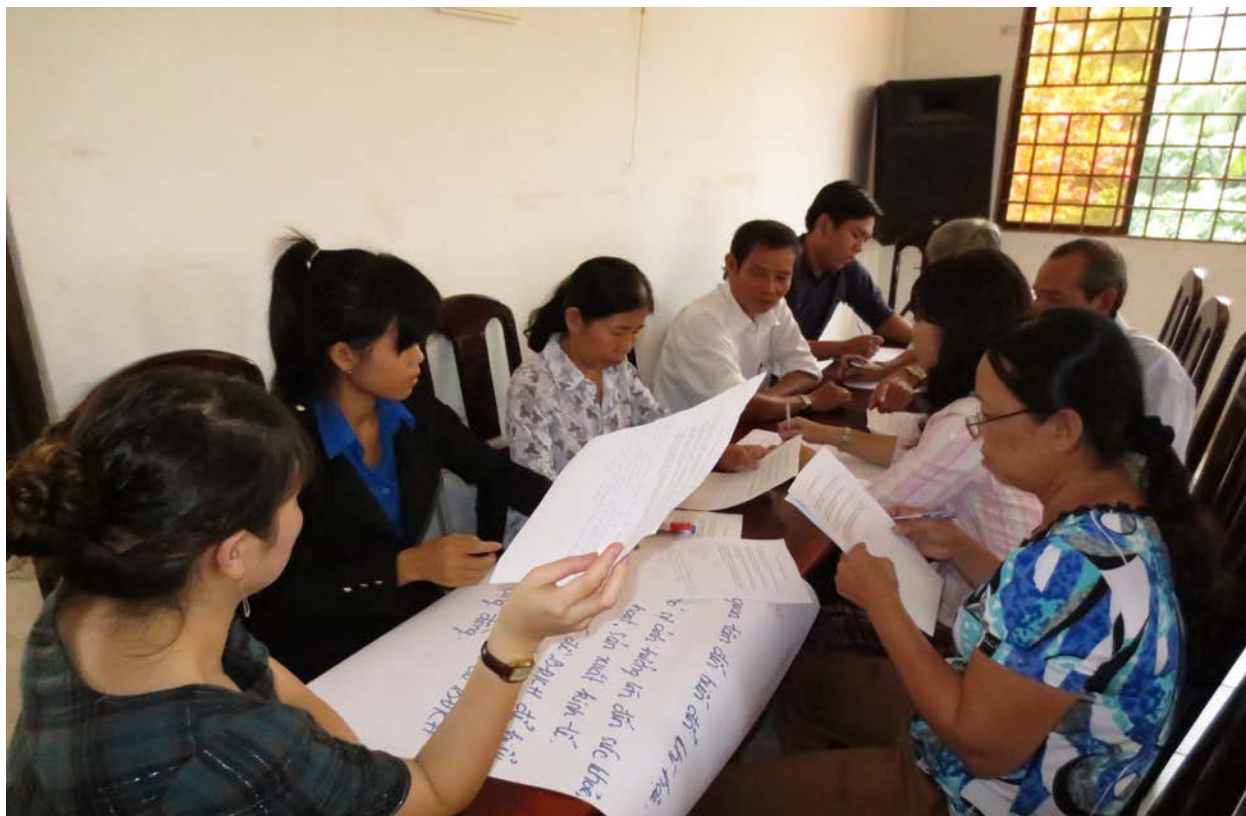
Shared learning dialogue with members of households in Can Tho City, Vietnam. From the project “Communicating Climate Change Risks for Adaptation in Coastal and Delta Communities in Vietnam.”

local climate impacts, vulnerabilities, and adaptation priorities. There are now 70 LAPAs in 14 districts, but implementation is just beginning. The innovative Integrative and Implementation Sciences (IIS) framework is being used to analyze the LAPA process, which is helping practitioners to see that differences in values (e.g. environmental, social, and political) between participants in the development of LAPAs can be negotiated, despite often being difficult to assess. However, consensus building (i.e. through a Shared Learning Dialogue) needs proper facilitation. There are also some methodological challenges around setting boundaries for research on LAPAs and how to obtain funding to conduct research on policy processes in Nepal. Yet there are many research opportunities to test pilot projects at the village level, to use Shared Learning Dialogues with groups at multiple levels of governance, and to spread the use of the IIS framework to analyze policy in South Asia. In Nepal, the link between the NAPA and LAPAs remains obscure in terms of who has power to do what during implementation.