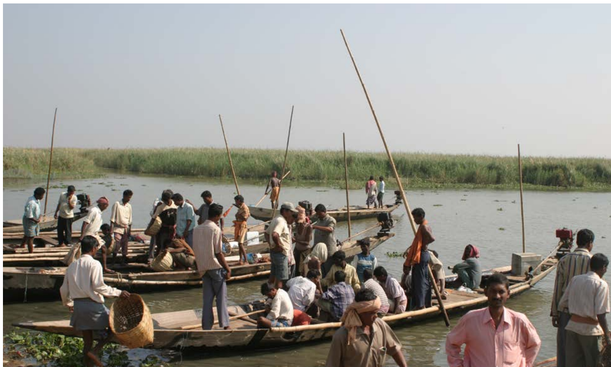
Fishing communities rely on services provided by wetlands in the Chilika Lagoon. From the project “Strengthening Livelihood Security and Adapting to Climate Uncertainty in Chilika Lagoon, India”.

lagoon area, which are based on a biophysical assessment of change in key ecological processes and services, including land use. Results suggest that some processes are critical, such as the salinity gradient which influences the migration patterns of various fish and shrimp species. Although the lagoon is in relatively good condition, it has been noted that wetlands are declining within the catchment. During the discussion, the impacts of changes in the wetland on fisheries and communities that rely on fishing were of particular interest. For example, the freshwater system had started to turn brackish in the 1970's, leading to a decline in fisheries until a blocked artificial artery was cleared in the year 2000. Additionally, public outreach strategies were discussed and the presenter indicated that research results should be framed in a positive manner to engage more stakeholders in wetland issues.