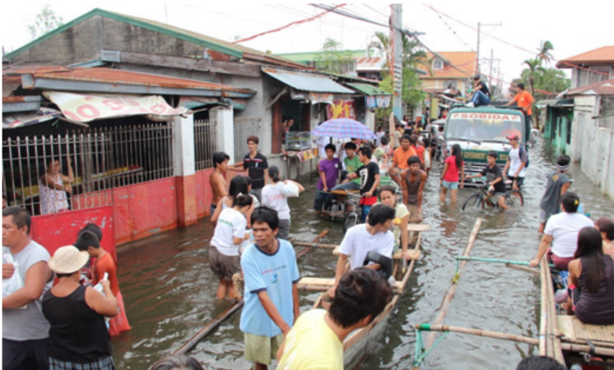
Flooding in the City of Santa Rosa, The Philippines. From the project "Gendered Adaptation to Climate-Induced Water Stress in Peri-Urban Southeast Asia".

Using a political ecology approach, the Asian Institute of Technology (AIT) is leading a regional research project assessing peri-urban vulnerability in three low lying sites in Thailand, Vietnam, and the Philippines characterized by poor infrastructure, weak institutions, and increasing competition for land and water resources. The project seeks to understand gender differentiated drivers of vulnerability and adaptive responses, as well as build technical capacities of urban development professionals to better understand these dynamics. Preliminary findings from all research sites suggest an increase in annual precipitation (Pathumthani, Thailand), an increase in surface temperatures and longer dry spells (Van Mon Commune, Bach Ninh Province, Vietnam), and higher incidence of flooding (Sta Rosa, Laguna, Philippines). This work engages city planners to add their perspective as to how technical, climate centric planning can incorporate social protection measures that build resilience. Following the presentation, participants were keen to understand how the government and citizens typically respond during and after an extreme weather event. It was noted that most action is taken after a crisis has occurred. In general, community-based organizations become more involved in advocacy, even though members of government often protect their own villages first.