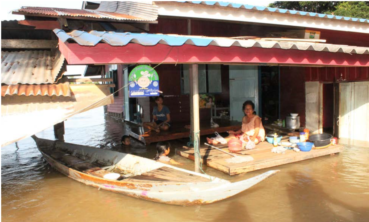
A household located at the bank of the Chao Phraya River in Thailand copes with severe flooding. From the project "Improving Flood Management Planning in Thailand."

development in floodplains) and poorly-planned physical infrastructure. The research team is using analysis of existing land-use regulations, socioeconomic costs, and the role of stakeholder participation to examine reforms that are now in the government pipeline. Evidence so far shows that flooding is made worse by institutional fragmentation and top-down planning. River basin councils have been set up, but they lack authority, and there are not enough meetings within government bureaus or between government and local people to discuss the issues. Overall, the Thailand (national-level) and Bangkok (city-level) governments have low capacity to deal with extreme water events such as floods, considering that they are often too focused on physical infrastructure and do not sufficiently address land-use decisions and related socio-economic issues.