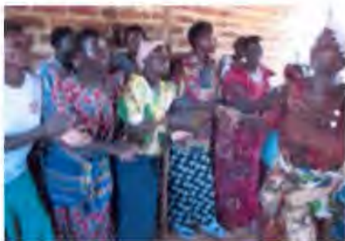
Akameze Tikatya Musana Women Group on stage

upland rice and cabbages. Some of the money was used for other farm activities. The funds also helped us to set up demonstration gardens to raise the level of awareness on climate change through raising tree nursery seedlings without incurring additional direct costs”.