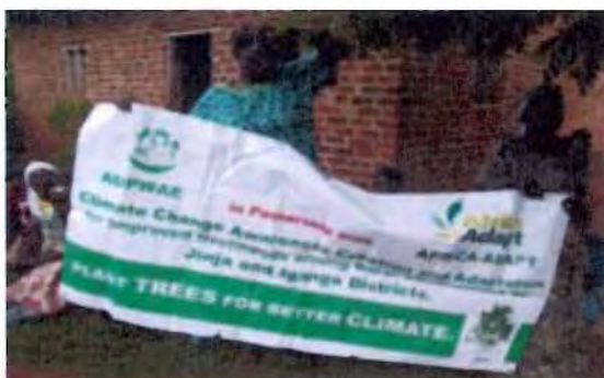
Bakusekamajja Women's Group with AfricaAdapt banner

money for facilitation of the group activities amounting to USh 920, 000/=, out of which, we used some to purchase pigs and are now making bricks from the proceeds of selling off some of the pigs.