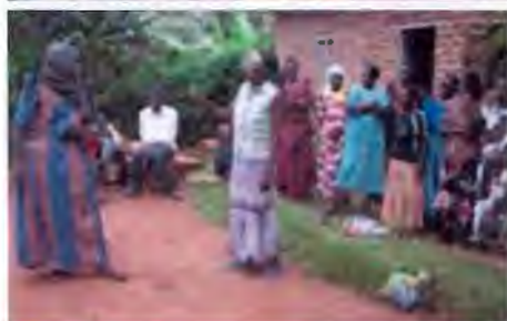
Bakusekamajja Women’s Group on stage