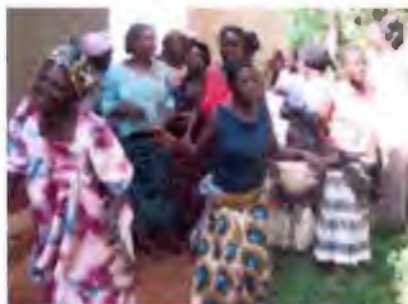
Lwigule Women Group on stage

group was to start a savings and loan association. We have been able to save 2.245 million Uganda shillings. After introduction to the use of improved farming practices with improved seeds and