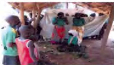
Bukawa Area Cooperative Enterprise on stage

increased income from knowledge gained through group activities. Also, before intervention of the drama group, health was a big issue. It is now better. We have more protected water sources and more pit latrines have been sunk”.