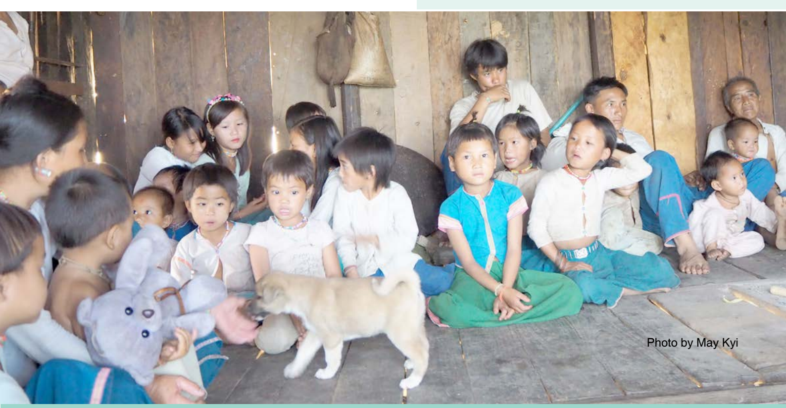
Parental perceptions of barriers and enablers of girls' education

Currently, in Myanmar, there are no significant gaps in literacy rates for boys and girls in the age group 15-19 years and educational attainment between boys and girls at the primary school level. However, the gender gaps are more prominent in high school and university completion rates. After primary school the percentage of girls who never attend school is higher than that of boys who never attend school.