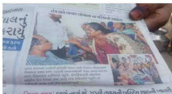
Media coverage of protests against lack of basic services by residents of Bombay Hotel (Divya Bhaskar, May 29, 2014)

Local leaders have also played a major role in mobilizing residents to demand basic services through rallies and protests to municipal offices. However, these have often not yielded any action from the AMC.