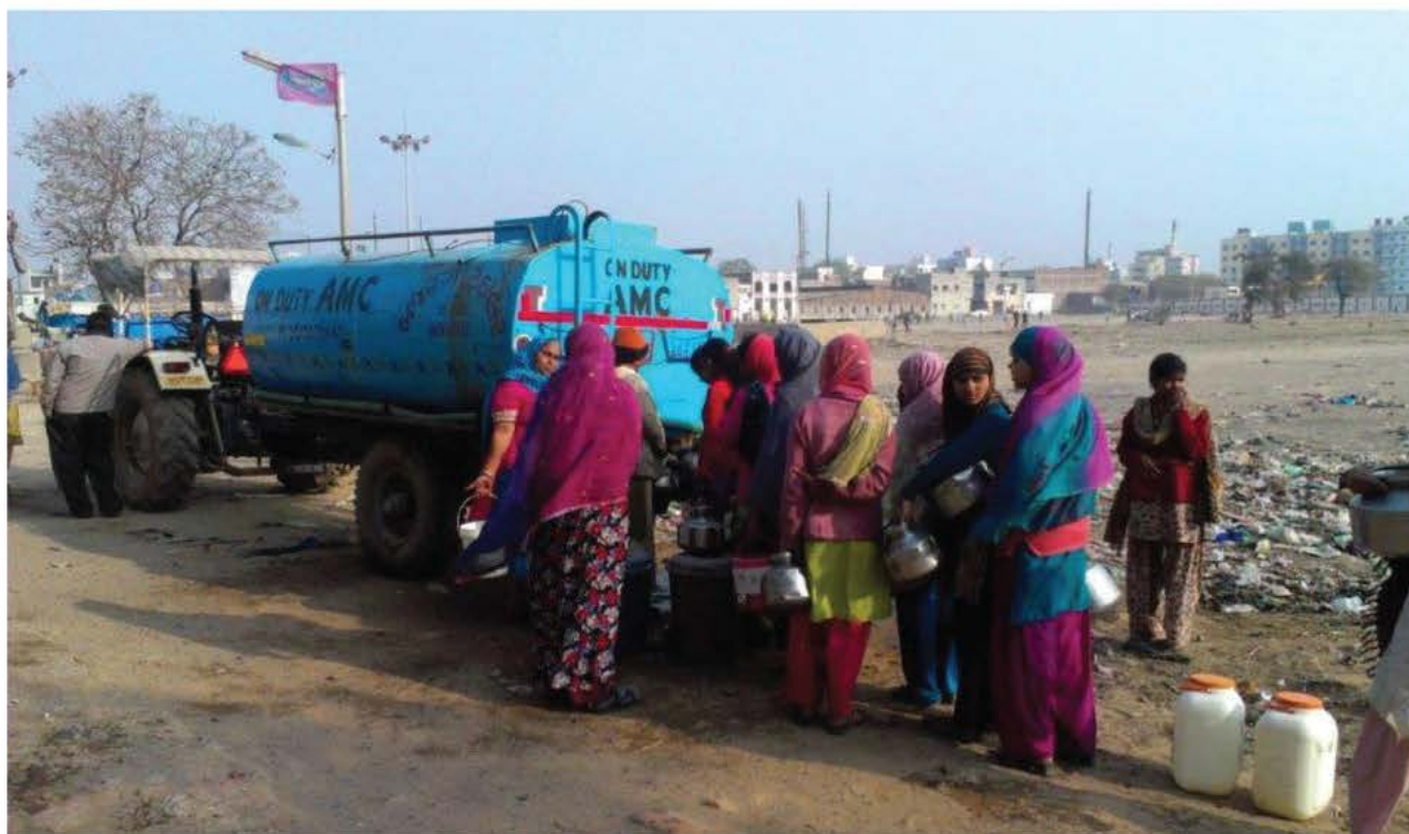
Queues on arrival of a municipal water tanker at Faizal Nagar Society in Bombay Hotel.

tankers were also provided to the residents of Citizen Nagar.