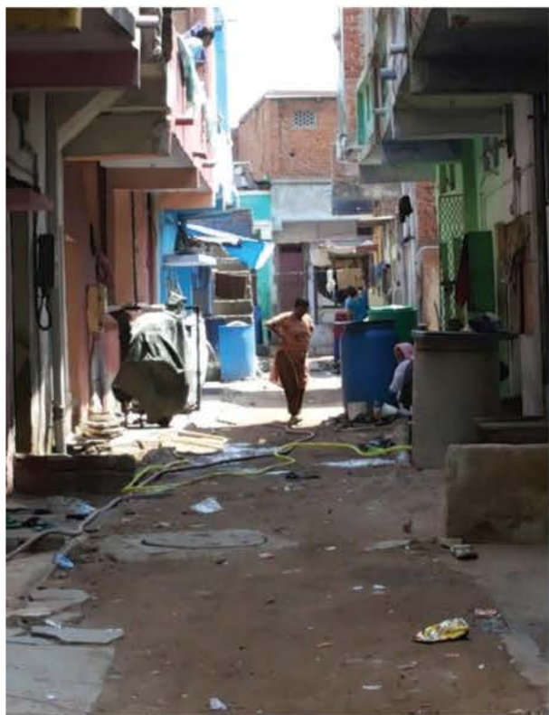
Water from the bore-wells is supplied for only 15-20 minutes every alternate day and is insufficient to meet the requirements of the residents.

Informal non-state actors have made money by charging residents for putting in drainage infrastructure and beyond this, they take no responsibility for the proper functioning and maintenance of this infrastructure. For instance, the builders who had initially provided soak-pits that were to be shared among 4-5 households did not pay any attention to their longer-term maintenance and simply connected these illegally to the private drainage lines of the surrounding industries. As a result, the soak-pits and drains, unable to withstand the burden of the increasing population in the locality, started overflowing frequently and created an unsanitary environment in the locality. This has also led to fights between residents who have had to incur regular expenses of calling in private cleaners to empty the soak-pits and clean the gutters. Solid waste that is