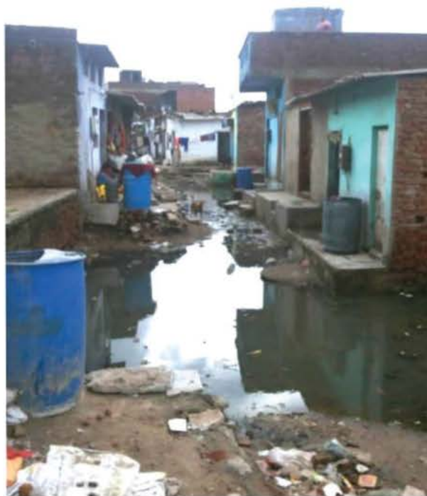
Water-logging in the internal lanes of Bombay Hotel during the monsoons due to poor drainage

Many of the informal suppliers in Bombay Hotel adopt violent practices and behavior in their dealings with the residents. Lack of alternatives reinforces the vulnerability of residents who are forced to put up not only with economic exploitation of the suppliers but also coercion, threats and abuse. Many residents earn daily wages and may not always be able to pay the monthly charges to the suppliers on time. This leads to warnings from the supplier and threats that their water / electricity connection would be cut. One woman resident referred to the water operator's behaviour towards residents as " shabdik atyachaar " (verbal torture). The feeling among women residents of being abused by the water operators is exacerbated by the fact that the latter are often under the influence of alcohol or drugs when they come to collect the monthly charges from them.