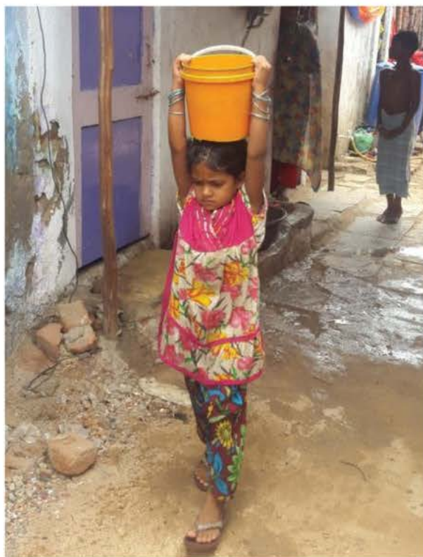
Children also bear the consequences of poor service delivery to the locality