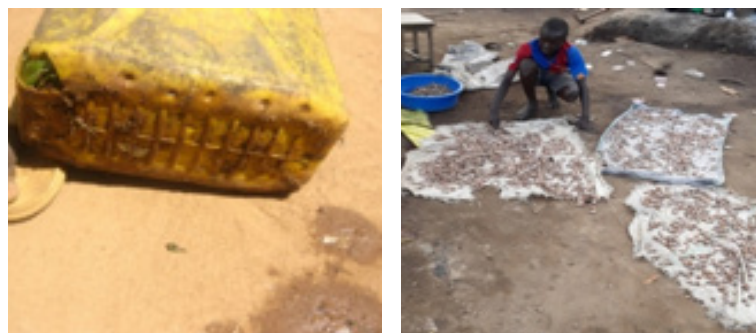
Figure 2: Fermentation methods practiced by farmers that are not recommended

The box is designed with a hand crank, which aids in the turning of the fermenting cocoa after 48 hours. For efficient mixing, the crank has rakes that are in contact with fermenting content thus facilitating uniform mixing.