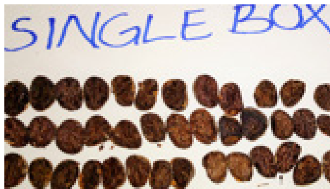
Figure 4: Cocoa bean colour after four days of fermentation

The box can handle 60 to 100kg of cocoa and has shown the potential to reduce the fermentation time from six to four days with 99% fermented beans. Unlike the tower fermentation boxes and heaps that require manual mixing using a rod/stick, the single box uses a crank that operates on the principle of an engine. This reduces the energy required to operate it. This method also reduces theft because fermentation can occur in an enclosed place. The localised fermentation also facilitates easy collection of sweating that is produced during fermentation. The sweating is highly acidic and if disposal is not controlled has the potential to deteriorate the environment.