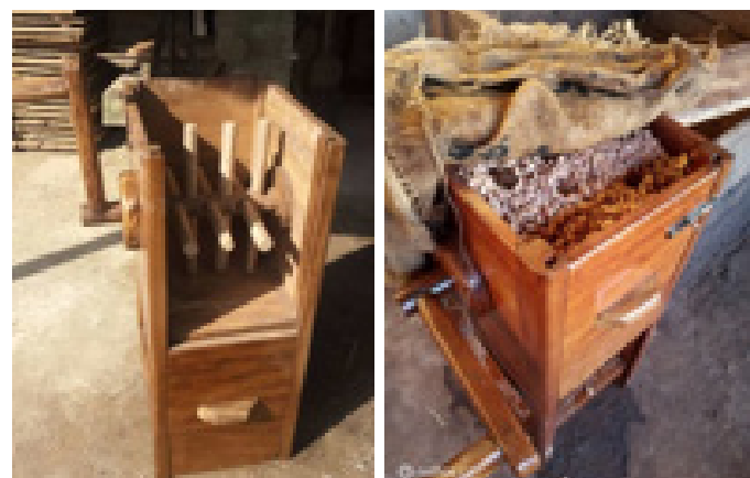
Figure 3: Single fermentation box showing the inside design and loaded box