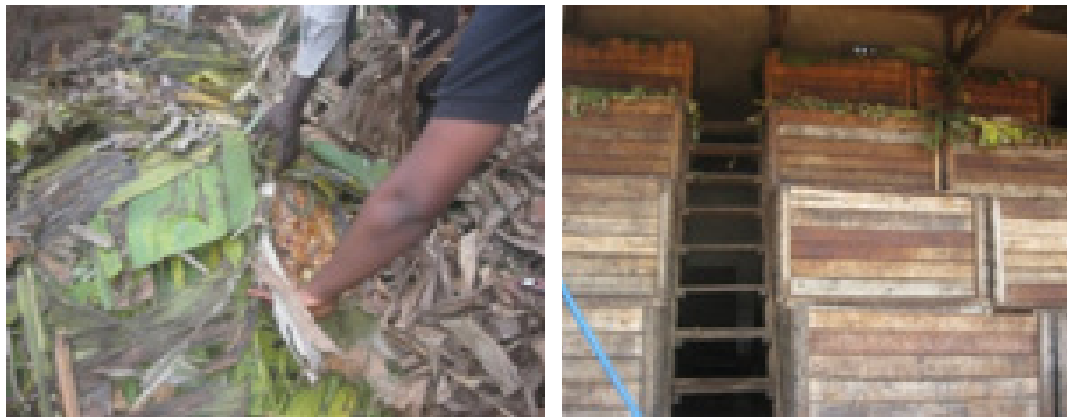
Figure 1: Recommended methods of cocoa fermentation (box and heap)