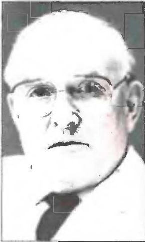
Howard Tatum who, while at the Population Council, invented the T-shaped IUD.

with the marketing of oral contraceptives, spawned revolutionary changes in attitude. Women could control more easily and effectively when and whether to have babies. "The Pill" offered a method that was comparatively easy and convenient, relatively safe, reversible, and highly effective when properly used. Today, it is the most widely used form of reversible contraceptive. However, oral contraceptives are not appropriate for every woman, so continued research was, and still is, needed into other promising contraceptives.