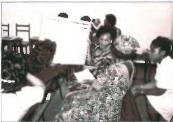
Counseling potential users about available methods of family planning in Nigeria.

That means continuing the search for new methods. The developers of NORPLANT recognize that the subdermal