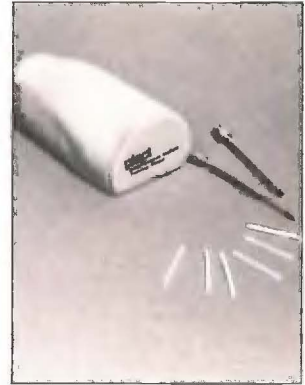
The texture of the "training arm" developed by PIACT closely resembles that of skin and muscle tissue.

Special centres established to train clinicians in NORPLANT insertion and removal were based on the expertise developed during the ICCR's clinical trials with the techniques. Several leading medical institutions in countries that participated in the early ICCR trials were selected to serve as international training centres. The Raden Saleh Clinic in Jakarta, Indonesia, and the PROFAMILIA clinic in Santo Domingo, the Dominican Republic, have trained physicians from Asia, Latin America, and sub-Saharan Africa; the clinic at Assiut Hospital in Assiut, Egypt, which became operational in 1989, will train clinicians from North Africa. A clinic in Santiago, Chile, the Instituto Chileno de Medicina Reproductiva, served as a training centre for the