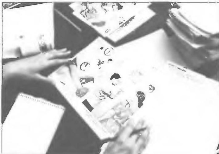
Testing the Spanish-language users' brochure.

to prepare their own information materials to inform and attract accepters, or to train clinicians and counselors.