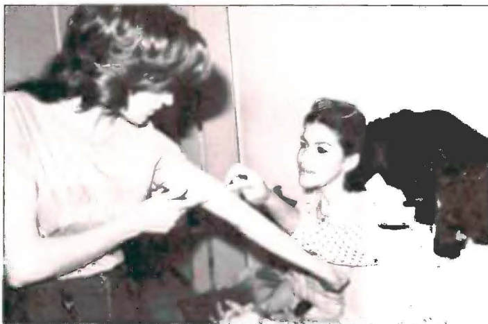
Woman in Brazilian clinic shows her implants to friends.

"The quality of service is of critical importance when a new and unfamiliar method is being introduced. In short, important as it is to have a satisfactory method, it is equally