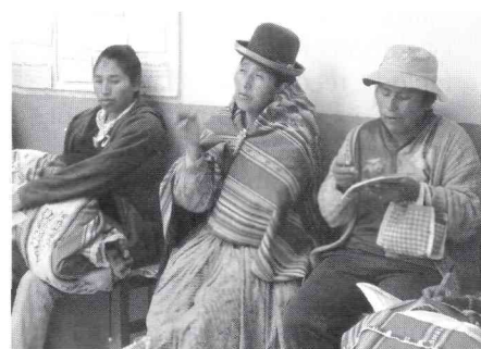
Bolivia – Women informing themselves. (By Cristina Echavarría. Source: MPRI/IDRC)

The project's objective was to promote and facilitate the consultation of all parties and democratic community participation in multi-sector decision making processes in mining areas, through the improvement of communities' negotiating abilities.