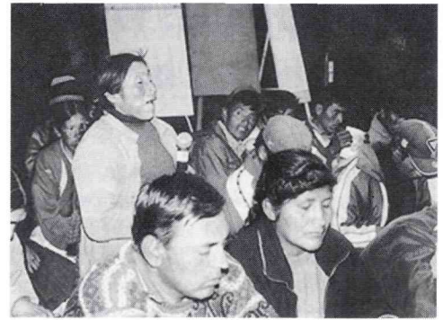
Participating in Tintaya's roundtable

An initiative promoted and supported by NGOs accompanying the weak local stakeholder in implementing a strategy for negotiating with the company regarding problems that provoke conflict. Its objective is to strengthen the community's ability to manage these problems and reach viable agreements with legal certainty for the parties.