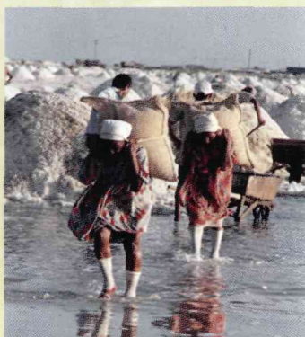
Indigenous Perspectives on Consultation