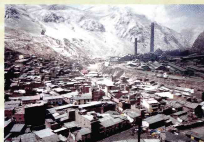
Multi-Stakeholders Processes in Peru