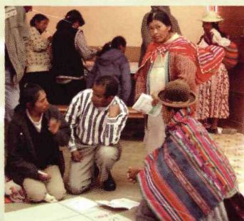
Bolivia - Learning to negotiate