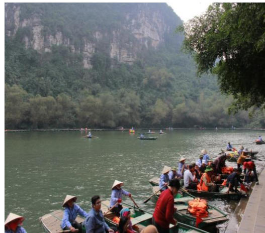
Boat tour in Trang An, Truong Yen commune, Ninh Binh, Viet Nam

Interested in this unique arrangement, CECR conducted research in Truong Yen commune, the largest of twelve communes in Trang An's 122 km 2 area. Like other nearby communes, Truong Yen has seen dramatic changes in recent years. Tourism has transformed the once rural landscape into a peri-urban one with concrete road systems, houses, and other hard infrastructure. Previously mainly agricultural, many residents now supplement agricultural livelihoods by working in tourism as boat riders or performing other tourism-related services (e.g. waitstaff, taxi drivers, food vendors, construction, etc.).