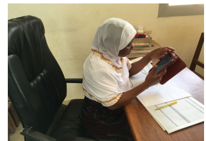
Figure 1: Health worker at Michenjele dispensary conducting data entry and

Collaboratively we developed electronic tool using WHO Quality of Care indicators for maternal and newborn health(World Health Organization, 2019). Then we conducted a number of evaluation activities. First, the electronic tool was verified to ensure that data collected through the tool are accurate. This was done on a quarterly basis by researchers from Ifakara health institute (IHI). Secondly, a qualitative study of the experiences of key stakeholders in the use of the tool was done with facility staff trained in and using the tool. During evaluation, we involved key stakeholders at District health management level and the Regional health management team level that included quality improvement focal persons. Routinely every month health workers were to upload the data about the patients they see at