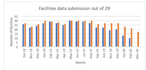
Figure 4: Dependency on supervision

Health workers working at maternal and newborn health in which majority (35%) were Enrolled nurses.