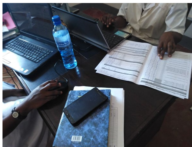
Figure 2: Data verification involved QUADS staff to visit and access data accuracy and consistency in different data sources including Registers, DHIS2, Patographs and the data sent using QUADS2 tool. This was done twice a year

ANC, Labor and PNC. Again, each month they uploaded data about viability and functionality of essential equipment and supplies and supervisions. Finally at the end of the year they had to upload data about the facility profile in general number of hours the facility is open, infrastructure, communication and staffing. Data sources involved HMIS tools, DHIS and additional tally sheets for the indicators that are not included in HMIS