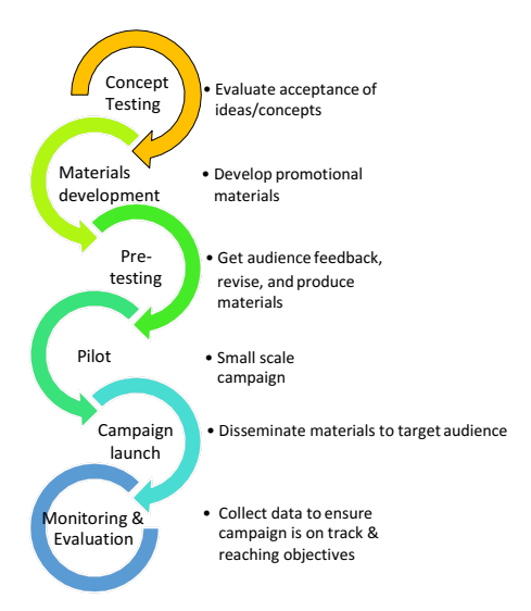
Figure 3. Implementation flowchart

Each country will adapt a work plan (also known as an implementation plan) to its specific needs and develop an individualized work plan and timeline based on the national context and priorities. The implementation/activity flow chart (pictured below) should be used as the basis for the campaign development. Note that this chart begins with concept testing since countries have already conducted a formative assessment, synthesized findings, and agreed upon creative concepts for testing.