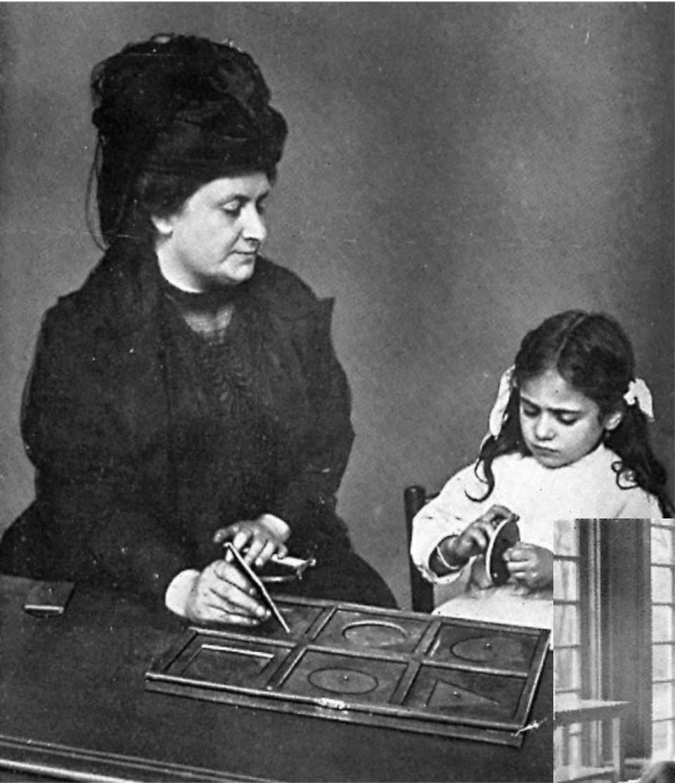
María Montessori (1870-1952)