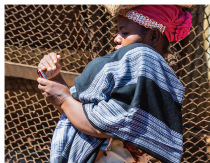
Addressing the barriers that hold women from accessing formal financial services is an integral part of financial inclusion.

Sourced from Global Banking Alliance for Women (2016)