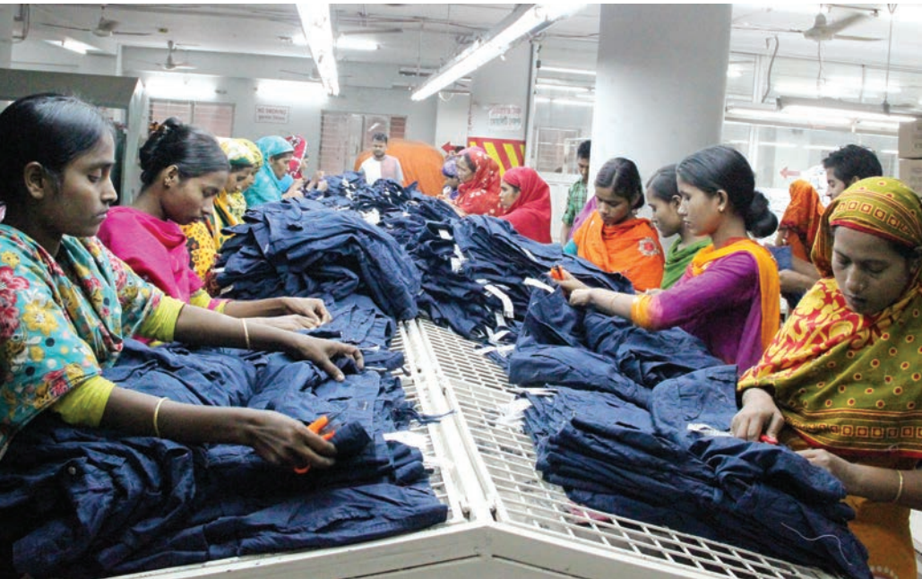
NTU STERN BHR

Bangladesh's booming garment exports — valued at US$25 billion in 2014 — have fuelled a major expansion in jobs for Bangladeshi women. Exports are expected to double by 2021.