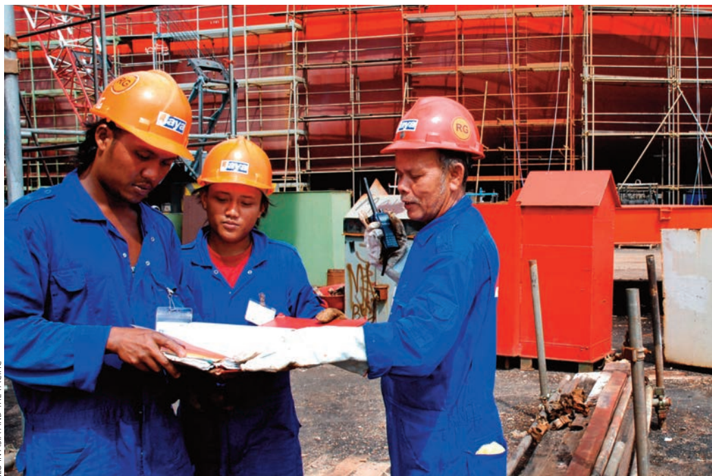
ILO IN ASIA AND THE PACIFIC

IDRC is helping Asian research institutions to identify options that will create the conditions for inclusive growth, leading to more and better employment. Supported research focuses on the most vulnerable, enhancing training opportunities for women and youth; identifying the right frameworks to protect workers and improve their conditions; and pinpointing the ingredients for small business success.