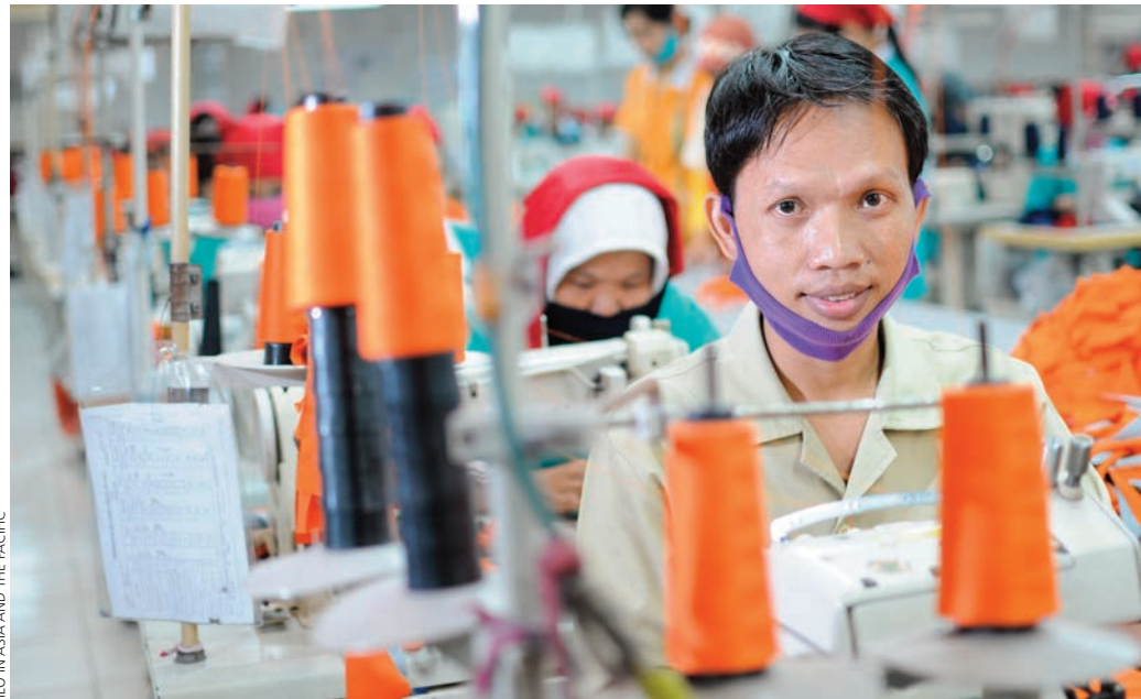
ILO IN ASIA AND THE PACIFIC

Since 2014, the Yangon-based Centre for Economic and Social Development has provided labour ministry officials and other relevant stakeholders in Myanmar with evidence about the development of fair and efficient labour markets as a basis for inclusive growth. The research includes studies on minimum wages, productivity, and migration; and a new survey on the needs of employers and employees in the garment and food processing sectors. A critical issue for the garment sector in Myanmar is the