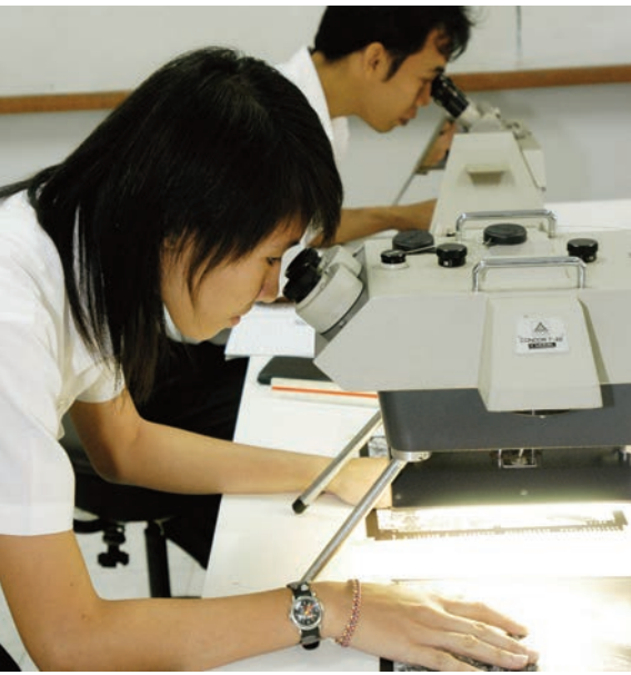
ILO IN ASIA AND THE PACIFIC

Education is essential to future opportunities. In several Asian countries with large youth bulges, investments in training will be needed to equip the next generation for work in more skill intensive sectors.