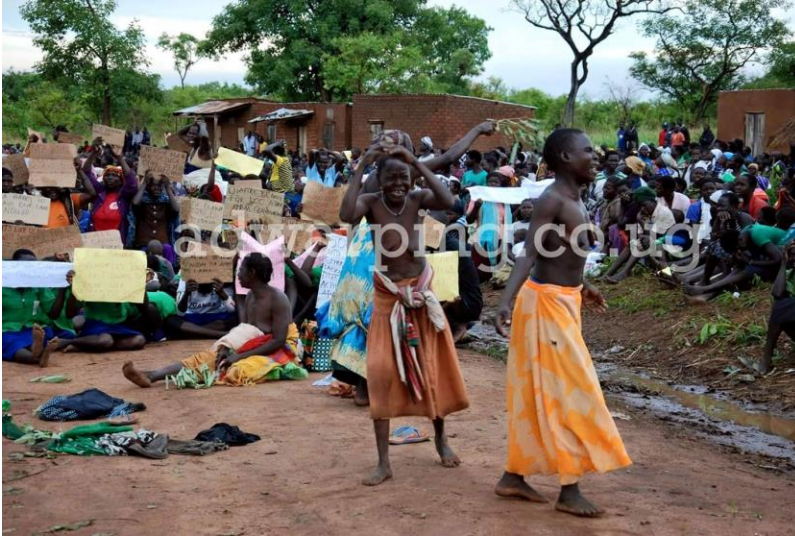
Above: Face to Face with Power: Women in Amuru demonstrate as a sign of resistance to proposals by government officials

On January 6 th 2015, a deed of settlement between the government of Uganda and the Amuru community was signed. Indeed, resistance by the community has engendered a process of relative inclusiveness in the acquisition process, but the situation is still uncertain. The lingering uncertainty generates undue suspicion and anxiety among the community.