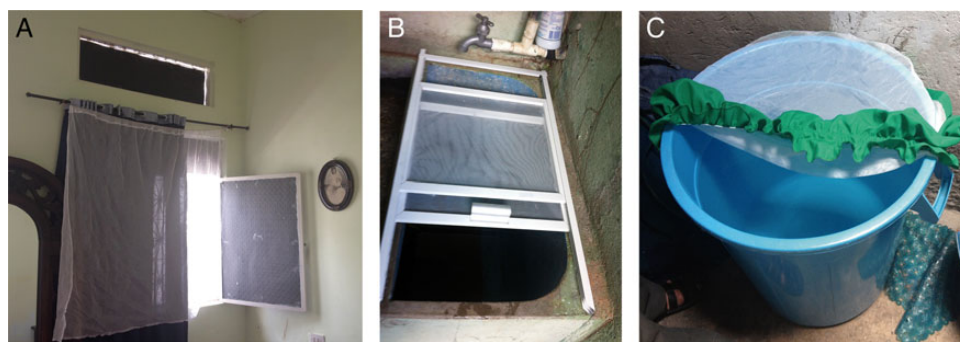
Figure 2. Curtains in windows, rectangular container cover and circular container cover. The Figure shows three intervention tools. (A) a curtain inside a household in Girardot. (B) the rectangular water container cover for rectangular or square cement containers of at least 200 L capacity; the cover is made of an aluminum frame, LLIN netting and a sliding mechanism for opening both doors. (C) the circular cover made of rubric, LLIN netting and rubber, for plastic and cement cylindrical containers that can store more than 200 L. This figure is available in black and white in print and in colour at Transactions online.