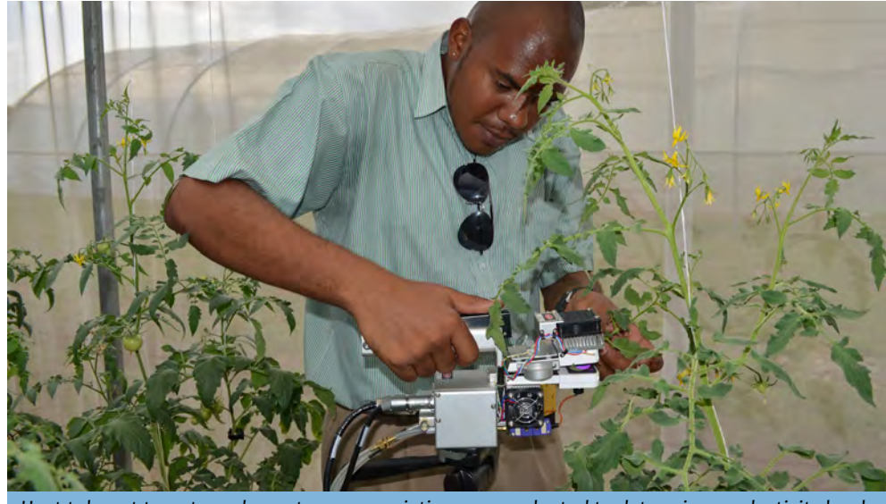
Heat tolerant tomato and sweet pepper varieties were evaluated to determine productivity levels under greenhouse conditions

resulting in increased income for the farmers and improved consistency in supply. Yields increased from 18 to 32 metric tons per hectare in tomato, from 17 to 25 mt/ha in pumpkin and from 3 to 10 mt/ha in string beans. The project demonstrated that technical and institutional support for irrigated agriculture resulted in increased yield and opened new markets for farmers, particularly women.