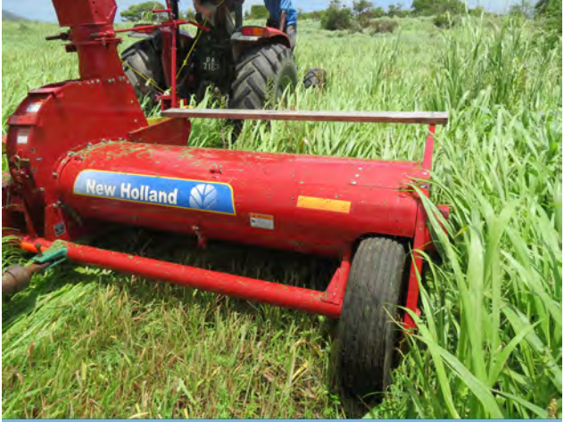
Mulato grass provided up to 8 mt/ha of biomass during the dry season

Trinidad and Tobago. <u>http://bit.ly/1uZuCQ8</u>.