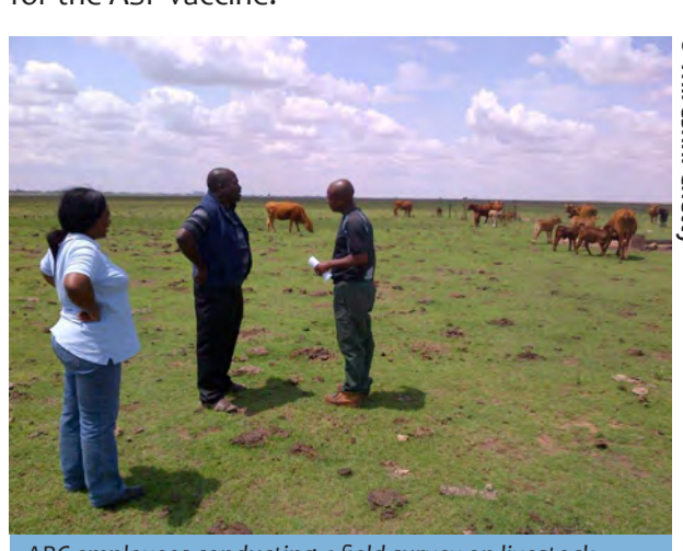
ARC employees conducting a field survey on livestock problems with an emerging farmer in Bultfontein, Free State Province

Once the second stage of the 5-in-1 vaccine development is complete, it will be evaluated for immune responses and protection in cattle, sheep and goats. The same will be done in pigs for the ASF vaccine.