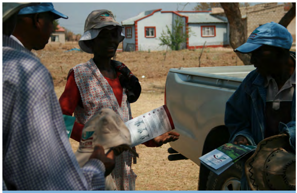
Emerging farmers discussing an information pamphlet developed within the project

of resources and benefits; participation and decision-making; and gendered needs of farmers. The findings will lay the foundation for further research on gendersensitive innovation in livestock farming systems. A second study will evaluate the economic impacts of two diseases (LSD and RVF) on the South African economy and emerging farmers.