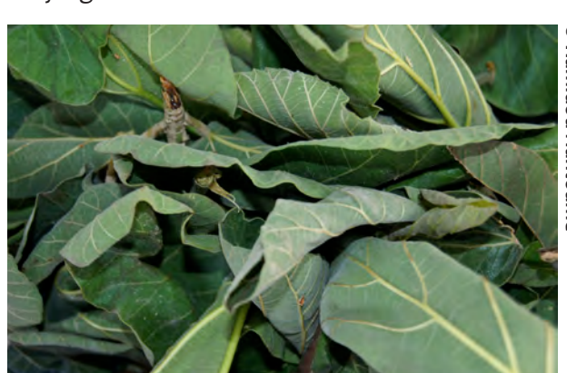
The price of tree fodder leaves can be up to 14 times lower than that of groundnut haulm

Over the course of this important Muslim holiday, at least one sheep is sacrificed by each head of household. Based on data from the last general census, it can therefore be estimated that on the day of this holiday in 2013, over a million sheep were slaughtered in Mali. The demand for rams generated by Tabaski, and the resulting monetary exchanges, are therefore very significant.