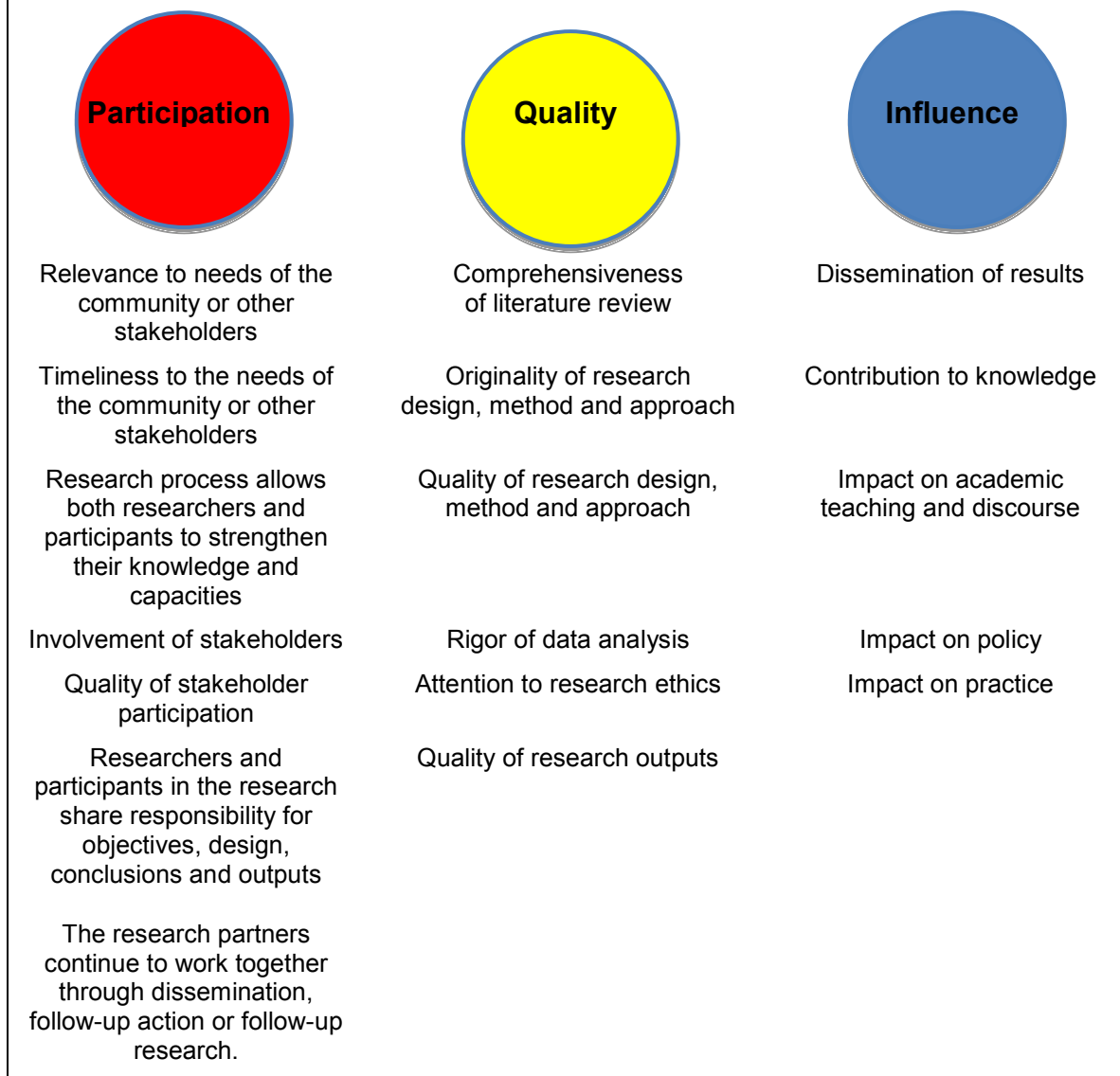
Figure 2: Three Categories of Research Excellence Criteria in the Provisional Framework